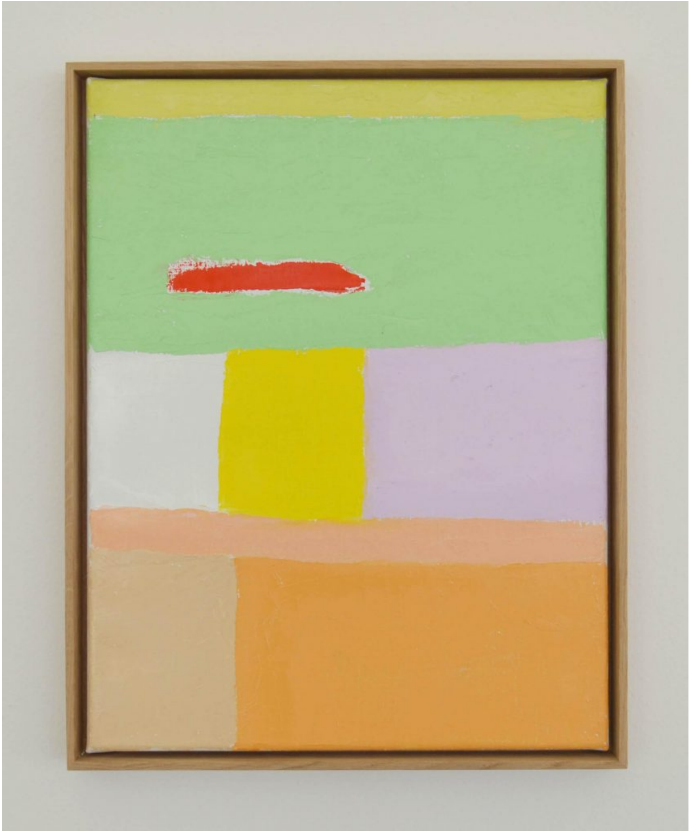
Etel Adnan Untitled , 2019 Oil on Canvas 41 x 33 cm Courtesy of the artist and Sfeir - Semler Gallery Beirut/Hamburg