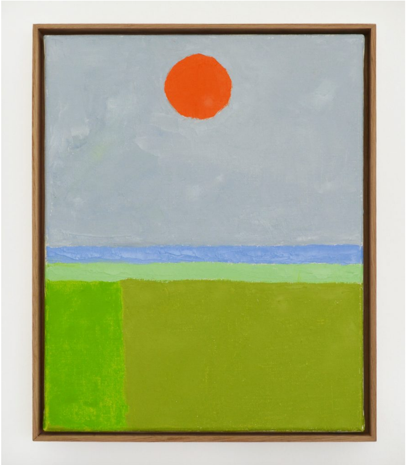
Etel Adnan Untitled , 2019 Oil on Canvas 41 x 33 cm