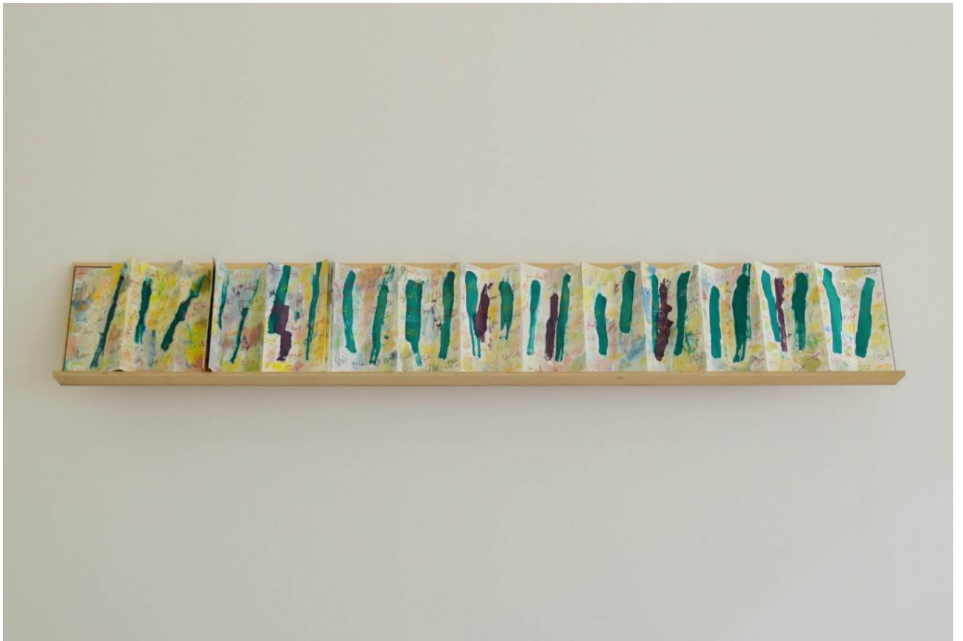
Etel Adnan Kalimat , 2018 Folded leporello book and watercolor on paper Cover 28.8 x 9.3 cm, 64 pages 28.2 x 8.8cm each Courtesy of the artist and Sfeir - Semler Gallery Beirut/Hamburg