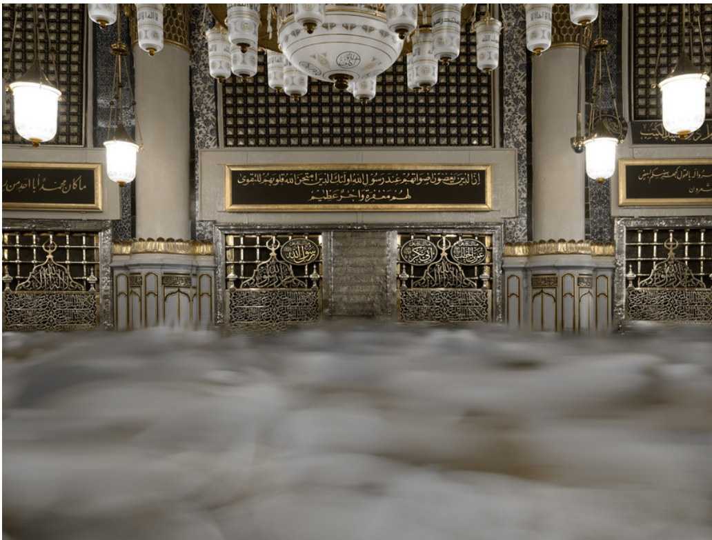
Adel Quraishi, Salam Oh Messenger of Allah.

21 Oct – 29 Nov 2015 at the Leighton House Museum in London, United Kingdom