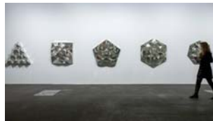
Art Basel: which Middle Eastern artists are showing at art fair?