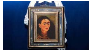
Frida Kahlo self-portrait expected to smash records with $30m sale