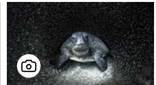
Stunning deep-sea images unveiled in the Ocean Photography Awards...