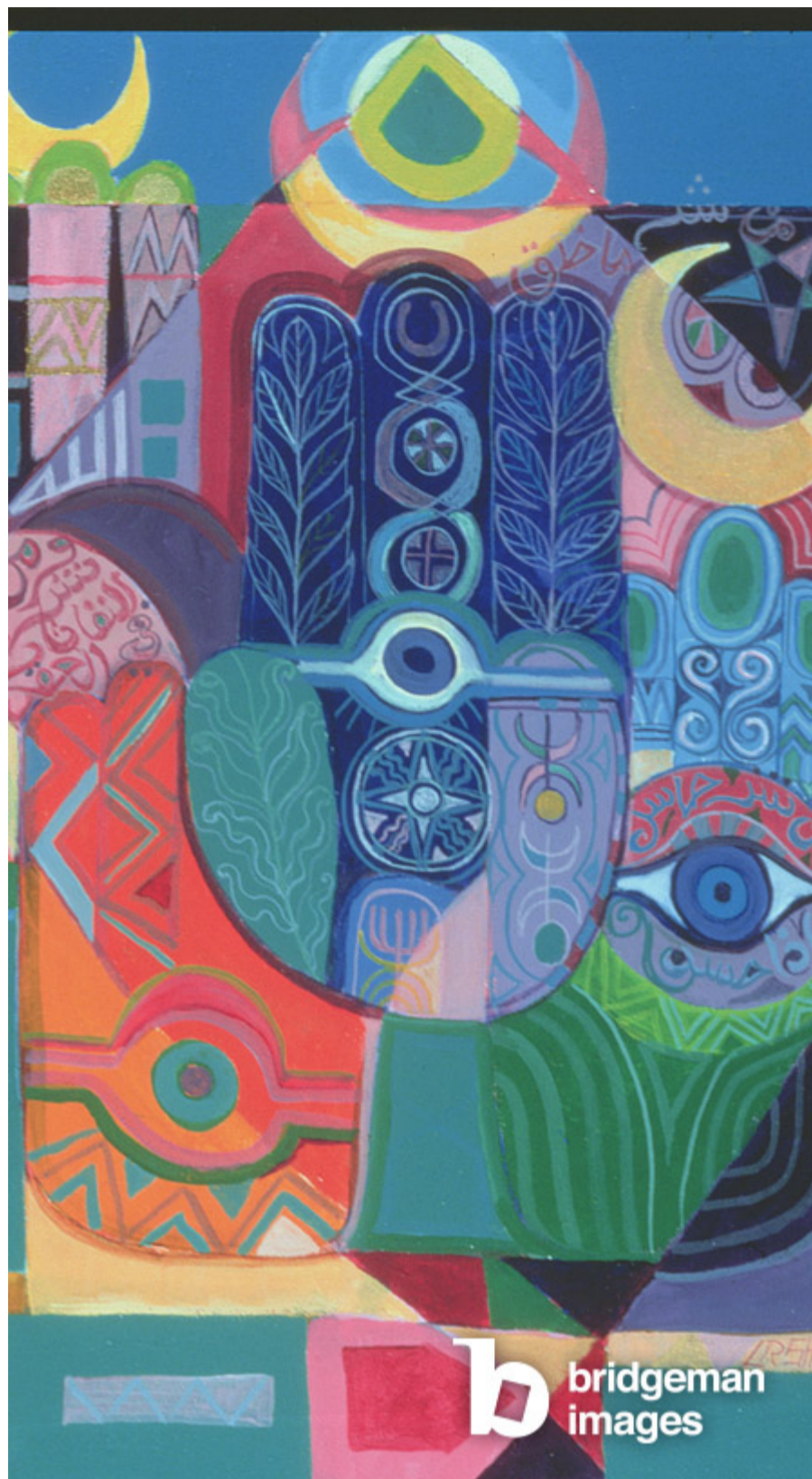
Hands as Amulets I, 1992 (acrylic on canvas) © Laila Shawa. All Rights Reserved 2023 / Bridgeman Images