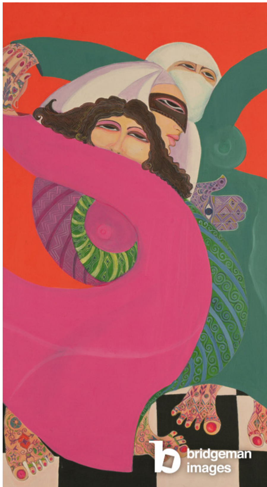
The Zar I, 1992 (acrylic on canvas) © Laila Shawa. All Rights Reserved 2023