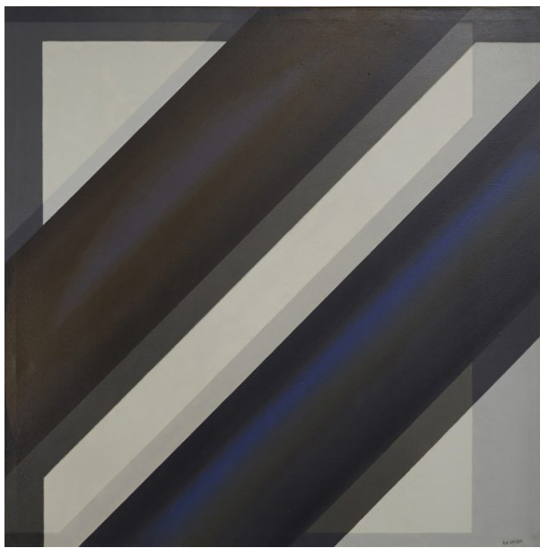
< https://greyartgallery.nyu.edu/wp-content/uploads/2020/03/Samia-Halaby-Two-Diagonals_cropped.jpg >