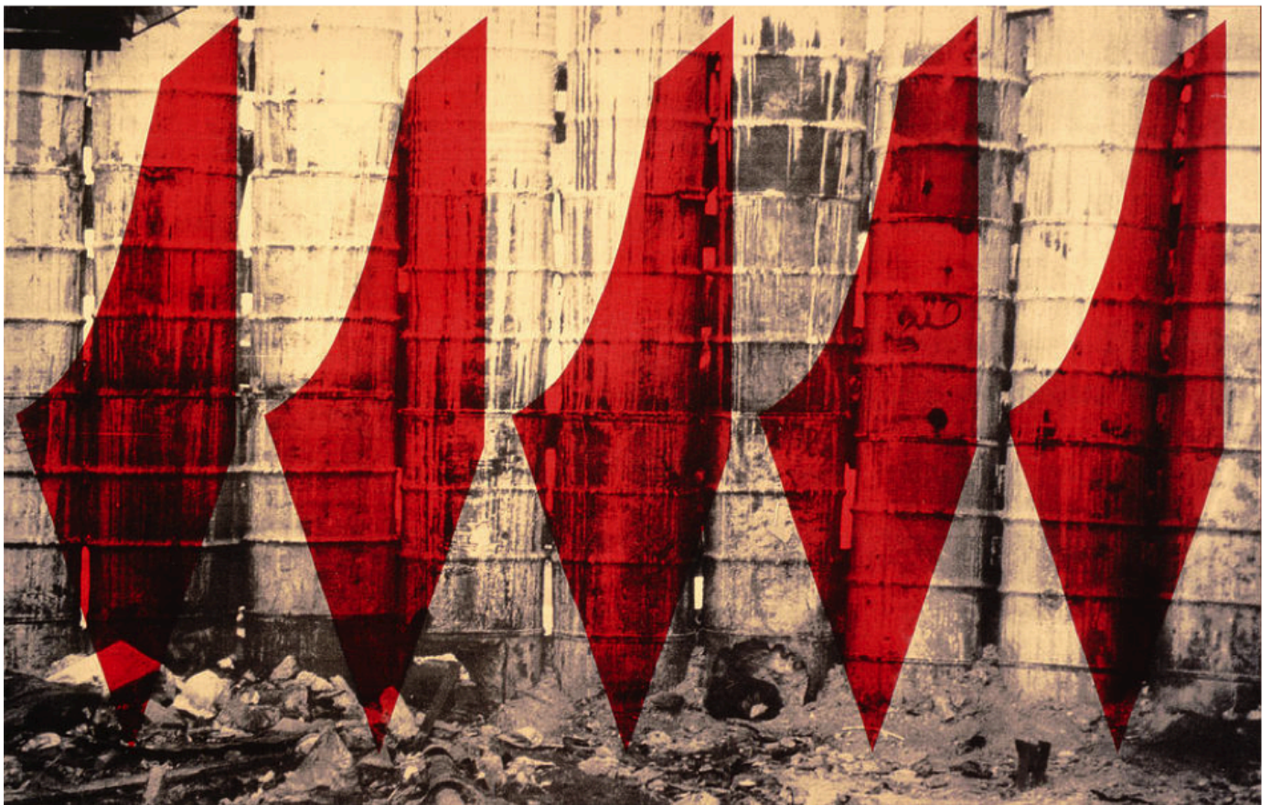
Barriers to statehood, 1992