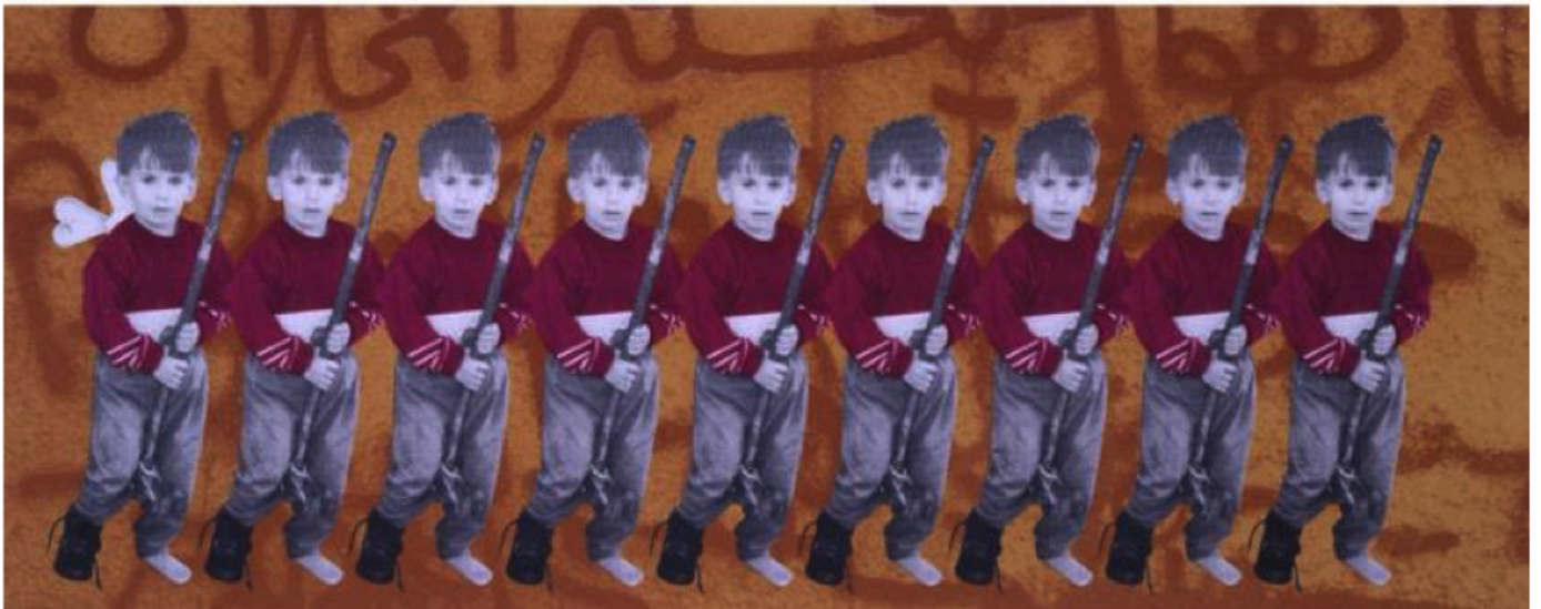
Children of war children of peace, 1996