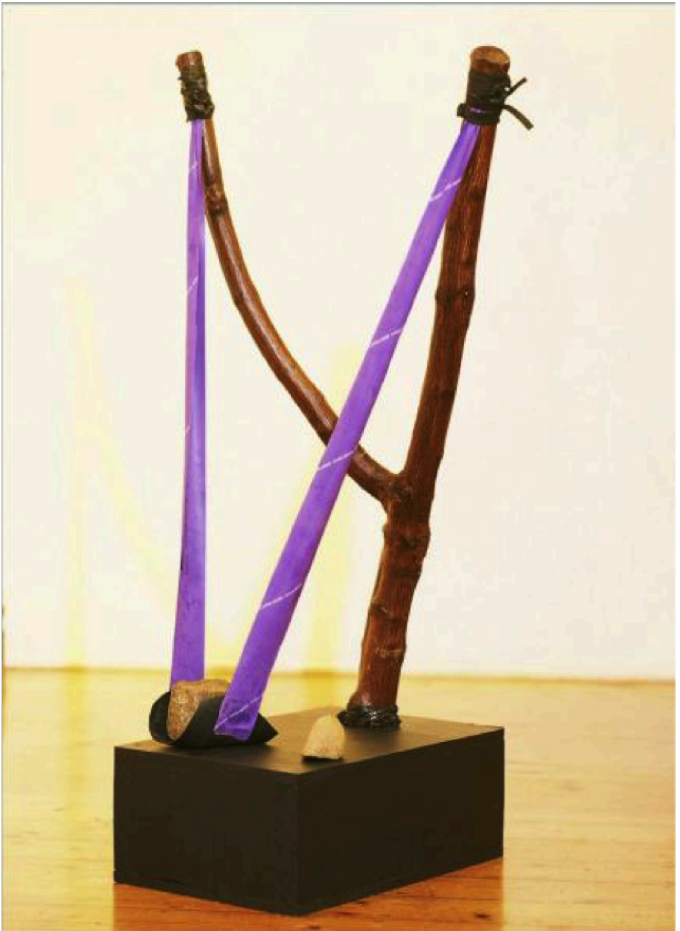
Weapon of mass destruction, 2002

And last but not least my favourite artwork of Laila Shawa.