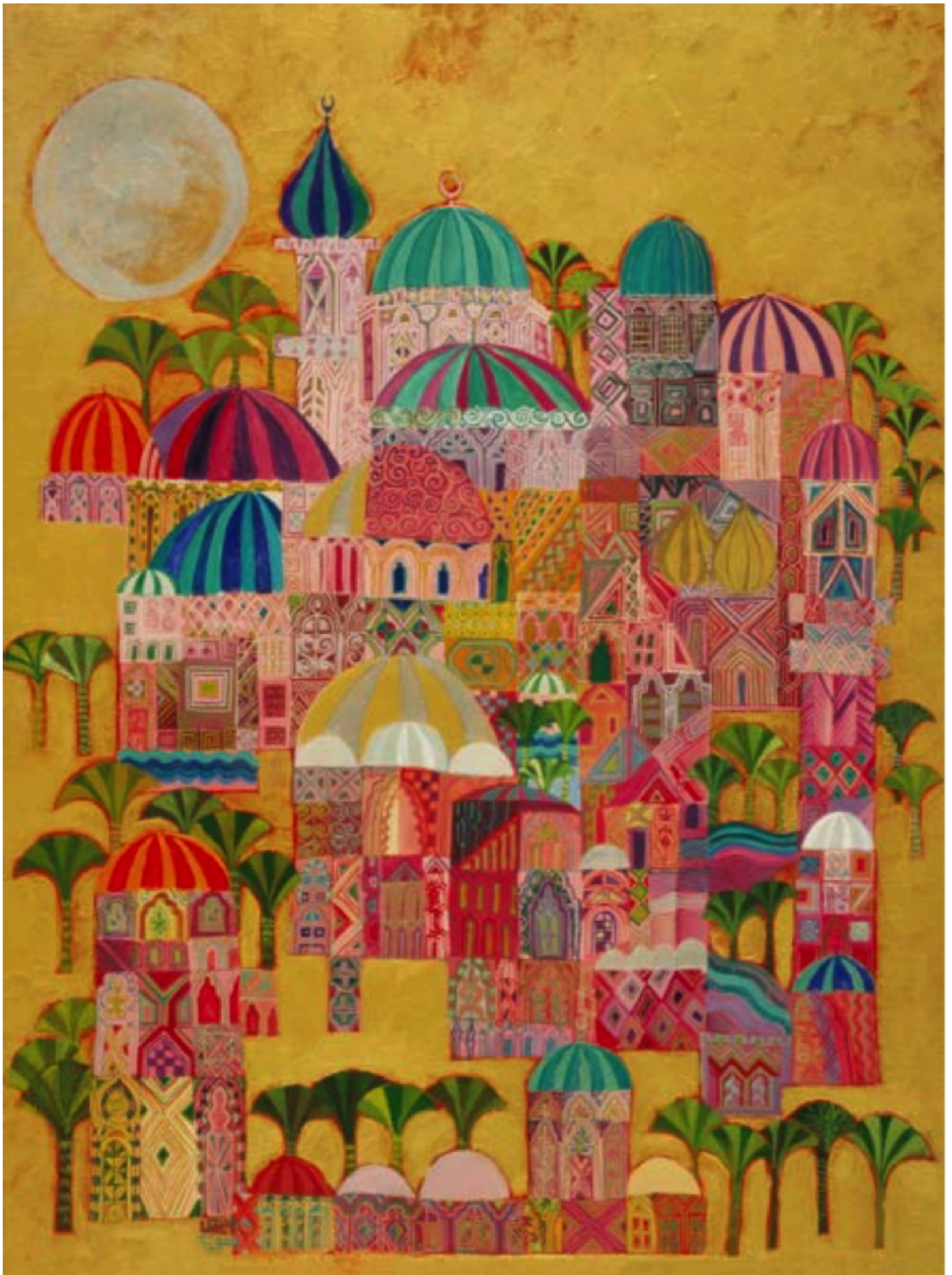
The golden city, 1993-94