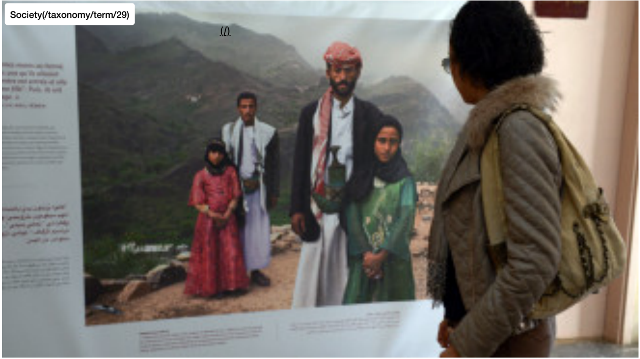
Meet the teenage girls taking on child marriage in Morocco (/features/meet-teenage-girls-taking-child-marriage-morocco).