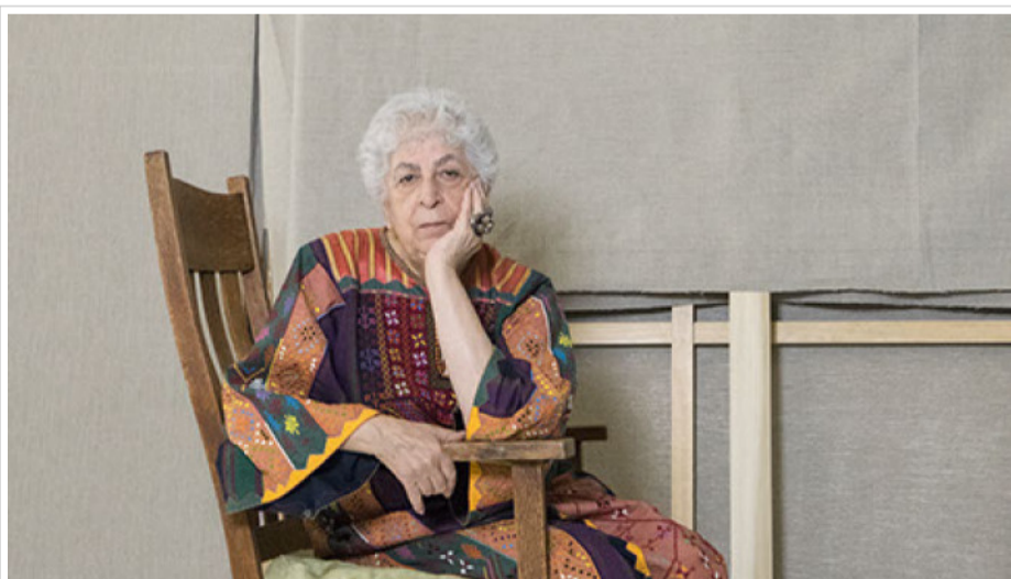
Samia Halaby is a pioneer of abstract painting

Today in her eighties, Samia Halaby is a pioneer of abstract painting and a central figure in Palestinian art, with an artistic career that started in the late 1950s and was also accompanied by a strong commitment to the liberation of her country.