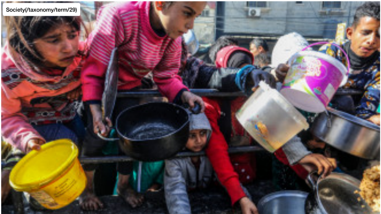
Dirty water and animal feed leave Gaza starving on its feet (/features/dirty-water-and-animal-feed-leave-gaza-starving-its-feet).