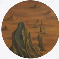
METAPHYSIC Salah Taher EGYPT