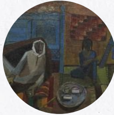
FAMILY FROM THE V... Saadi Al Kaabi IRAQ