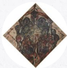
UNTITLED (ZAAR) Kamala Ibrahim Ishaq SUDAN