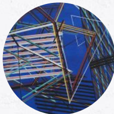
UNTITLED (KITTY H... Nabil Nahas LEBANON