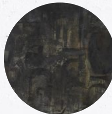
MINDSCAPE Maliheh Afnan PERSIA