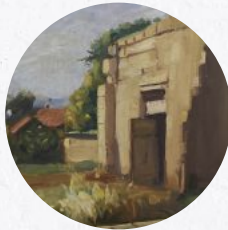
LANDSCAPE Omar Onsi LEBANON