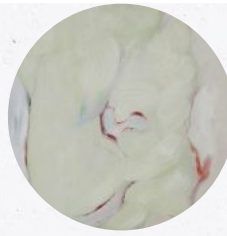
CELESTIAL FORMS Simone Fattal SYRIA