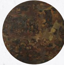
COMPOSITION NO. 3 Ramses Younan EGYPT