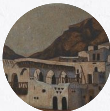
UNTITLED (MALLOULA) Louay Kayyali SYRIA