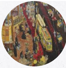
QUARTIER POPULAIRE Zeinab Abd El Hamid EGYPT