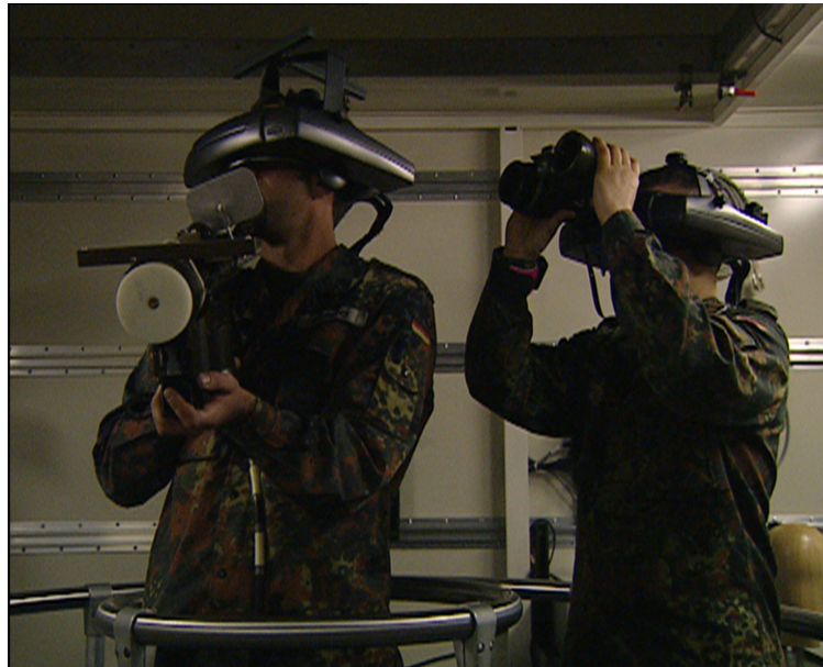
Harun Farocki, War at a Distance , 2003. Video (color, sound). 58:00 minutes. Museum of Modern Art. Committee on Film Funds. © 2019 Harun Farocki Filmproduktion.

modern Iraq with its ancient cultural heritage. Gulf War has little depth—the folds of the woman's dress flowing directly into the striated wings of the guardian behind her, both figures pierced by bullet holes. In War Painting , the dress becomes a fluted column, while both the woman and the stone face behind her weep at the ruins strewn about. Decades before the Islamic State made it a media spectacle to destroy history, Iraqi artists understood the intertwined nature of the human and cultural toll of war.