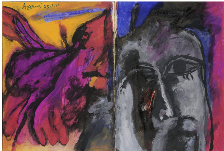
Dia al-Azzawi, War Diary No. 1 , 1991. Gouache and charcoal on paper, 28 pages, 12 x 9.5 inches. Courtesy of the artist.

Victim's Portrait (1991), renders a large and colorfully abstracted face of an Iraqi soldier immolated by the allied aerial bombing during the Iraqi retreat from Kuwait. The work is hung next to an archival copy of the British Observer , which published a controversial frontpage image of the burned corpse after American outlets refused to circulate it.