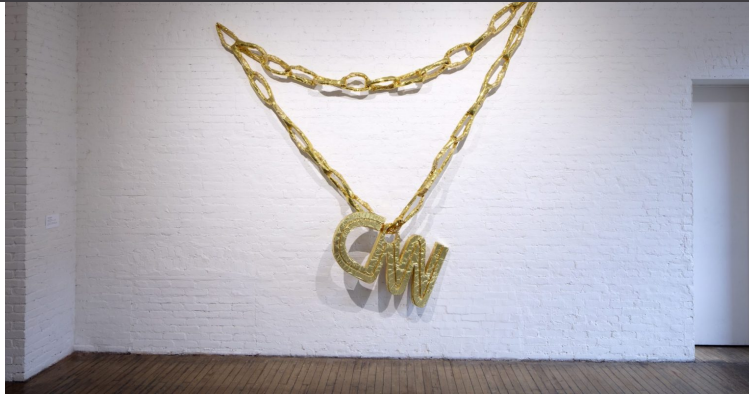
Installation view of Thomas Hirschhorn, Necklace CNN (2002) on view in the exhibition Theater of Operations: The Gulf Wars 1991–2011, MoMA PS1, New York, November 3, 2019–March 1, 2020.

But for every distant Western view on the conflict within the show, there is an on-the-ground riposte. Monira Al Qadiri's large-scale video projection, Behind the Sun (2013), chronicles the wanton burning of oil fields in Kuwait by Iraqi forces withdrawing from the advancing American-led coalition in 1991. Filmed by a local Kuwaiti, overlaid with spoken Arabic poetry from daytime television programs, unseen poets praise the heavenly beauty of nature in stark contrast to the hellscape blazing before their eyes. These dueling fields of vision—one aerial, the other landscape—broadly evoke the disparity between the American view of the wars and its lived experience in the Gulf.