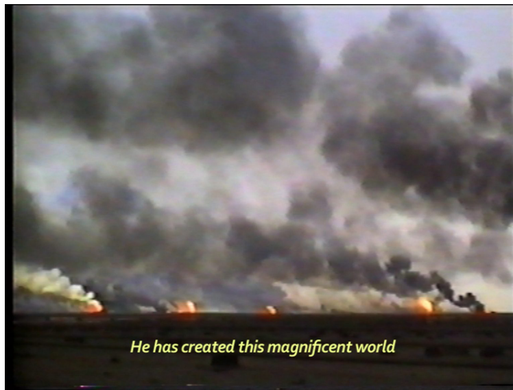
Monira Al Qadiri, Behind the Sun , 2013. Video (color, sound). 10:00 minutes.

The term ‘theater of operations’ refers to the totality of land, air, and sea contained by a discreet military operation within a larger ‘theater of war’ waged between opposing forces 1 . There is an implied hermeticism to these words, a total spatial and martial enclosure that reaffirms the Western forays into the Gulf Wars as a series of “surgical” strikes specifically targeting only “legitimate” combatants,