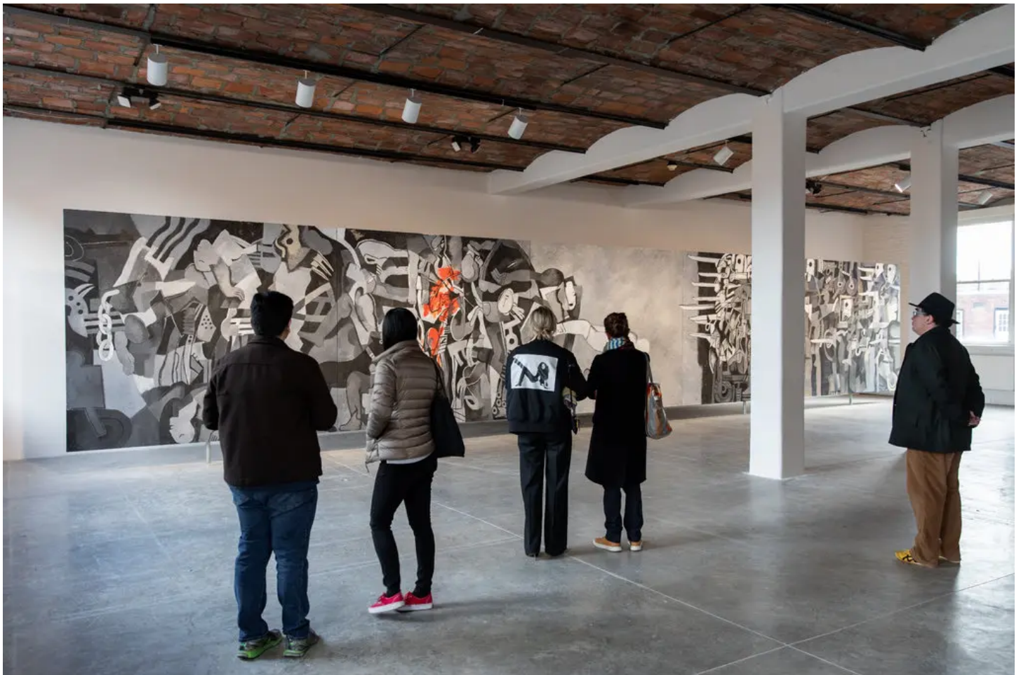
Dia al-Azzawi’s “Mission of Destruction,” inspired by Iraqi abstraction, Arab calligraphy and Picasso.