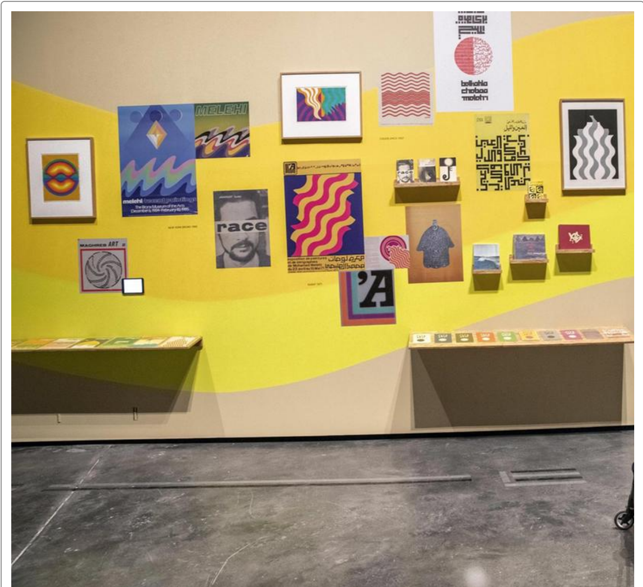
Alserkal Avenue held its first art event since the onset of Covid-19 on Saturday, September 19.

One of the first art events featuring large gatherings in the UAE, Alserkal Lates signals a desire for a cultural comeback