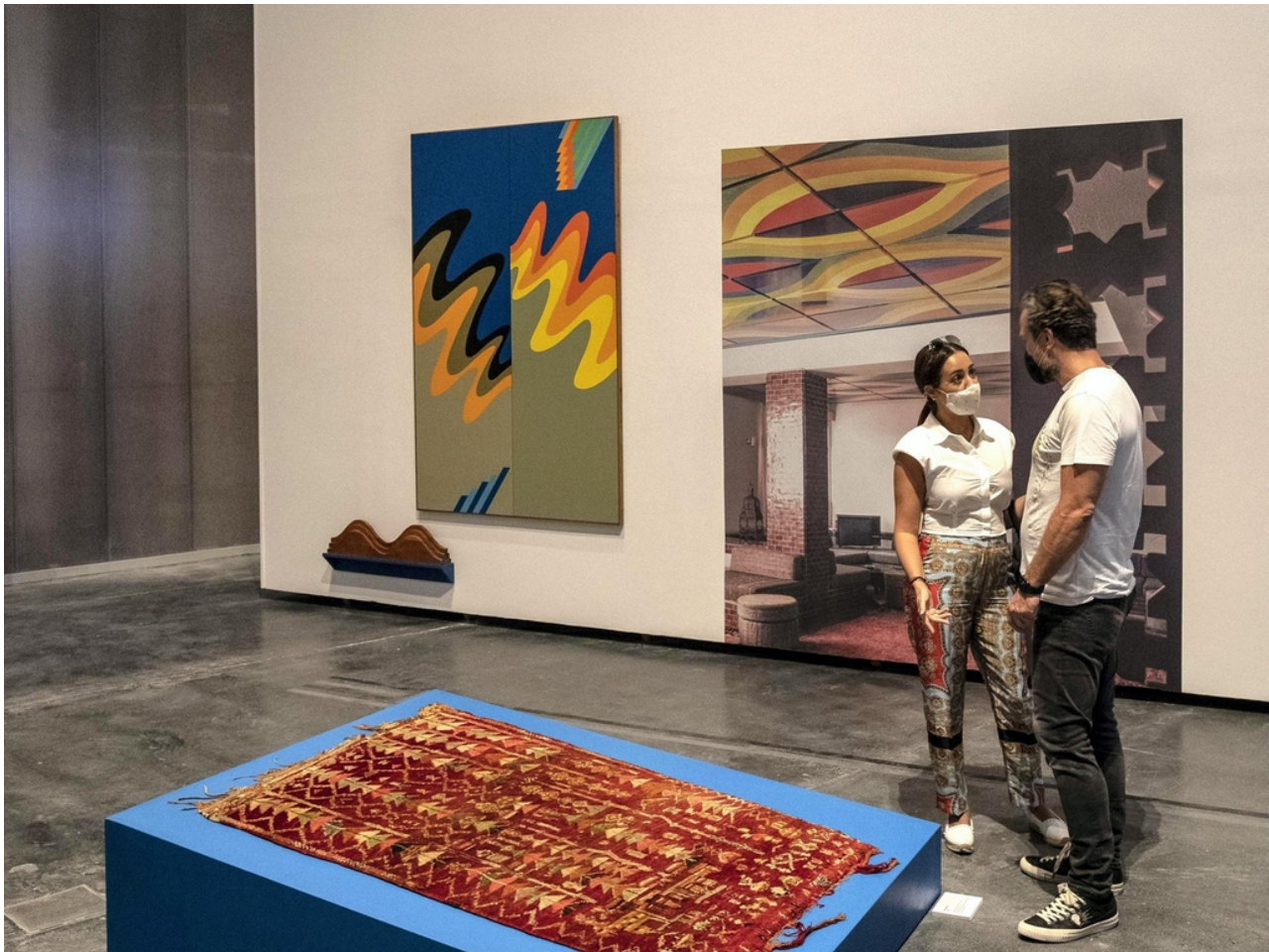
Inside the exhibition New Waves, featuring the work of Mohamed Melehi. Held in Concrete, the show requires pre-booking to enter.