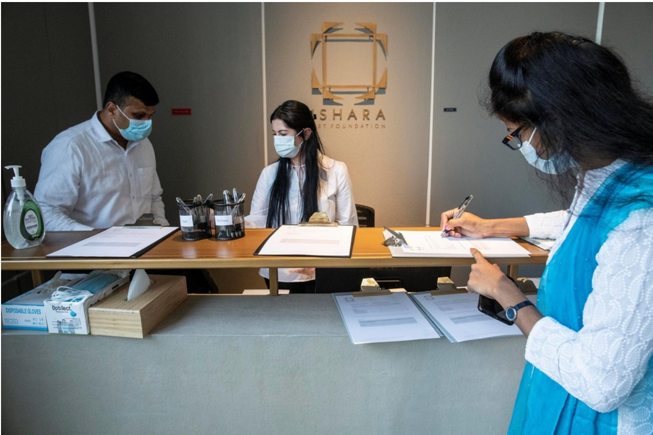
A visitor fills out a contact tracing form at Ishara Art Foundation.

Physical distancing was the hardest measure to maintain. Even with fewer people going into galleries, paths still sometimes cross when looking at the works. A more stark example was at the entrance of the exhibition New Waves: Mohamed Melehi and the Casablanca Art School Archives , a major retrospective on the Moroccan artist, housed inside multidisciplinary space Concrete.