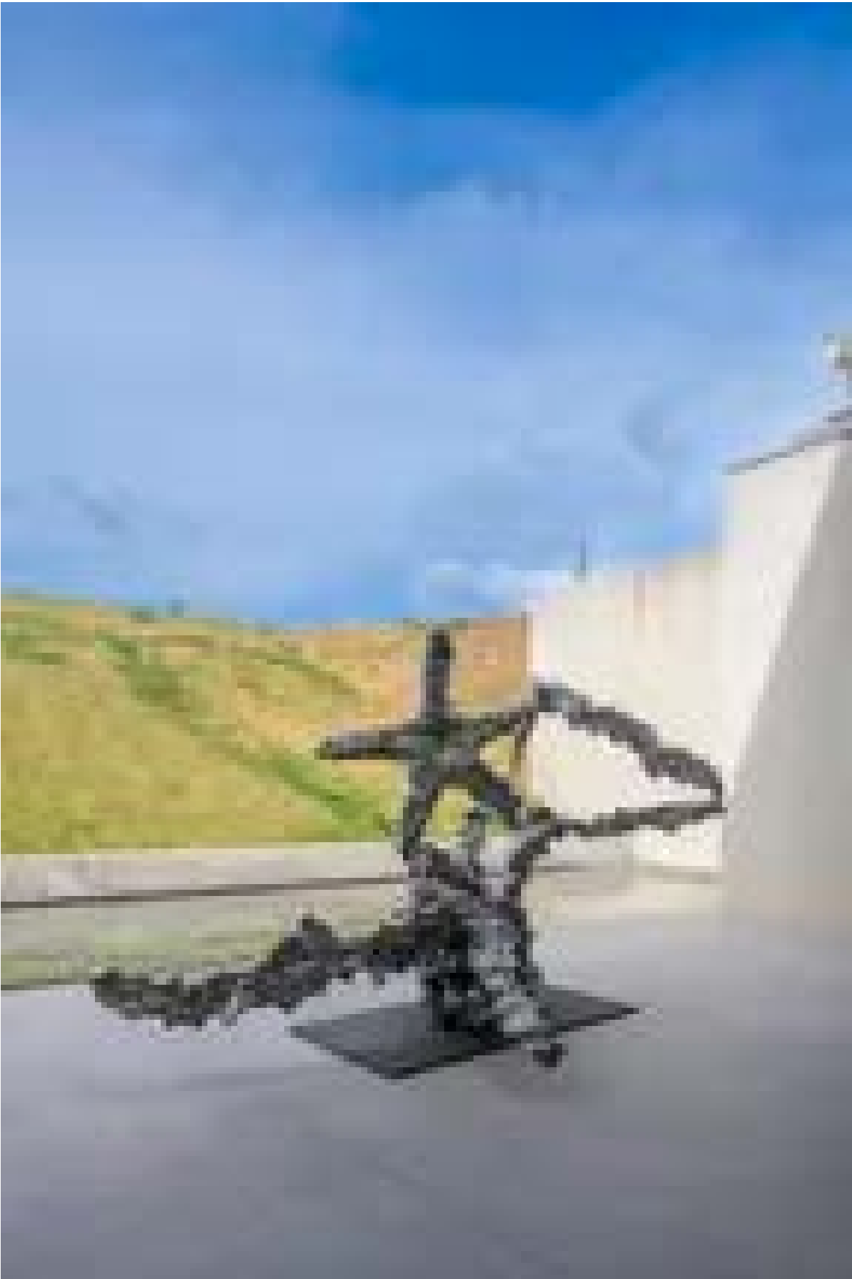
Nabil Nahas' monumental sculpture at Chateau La Coste