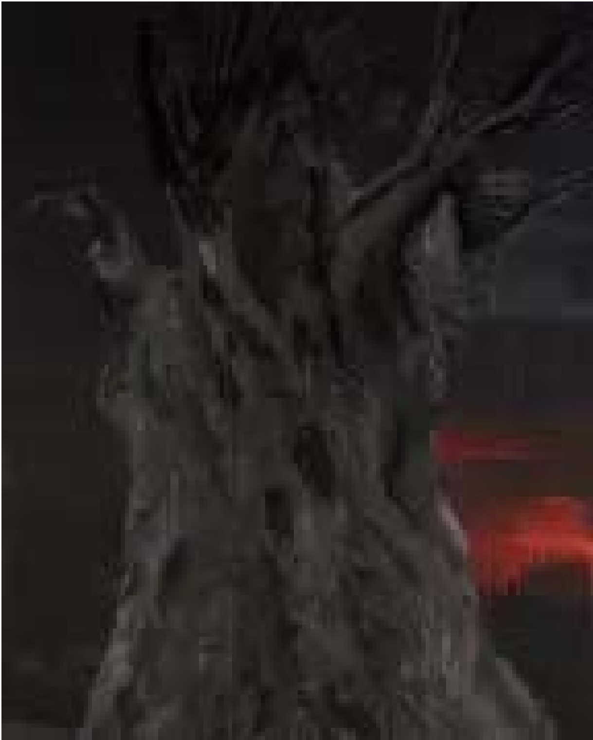
Nabil Nahas, Untitled, 2022, acrylic on canvas, 250 x 200 cm

Describe the personal series linked to your Lebanese roots, this gallery of portraits featuring trees critical to the history, culture and ecology of your homeland. How did you go from abstraction to painting trees?