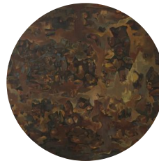
COMPOSITION NO. 3 Ramses Younan EGYPT