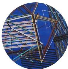
UNTITLED (KITTY H... Nabil Nahas LEBANON