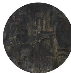
MINDSCAPE Maliheh Afnan PERSIA