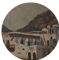
UNTITLED (MALLOULA) Louay Kayyali SYRIA