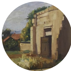
LANDSCAPE Omar Onsi LEBANON