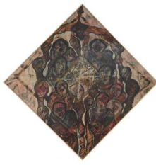
UNTITLED (ZAAR) Kamala Ibrahim Ishaq SUDAN