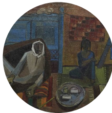
FAMILY FROM THE V... Saadi Al Kaabi IRAQ