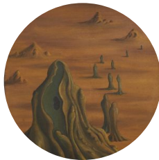
METAPHYSIC Salah Taher EGYPT