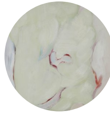
CELESTIAL FORMS Simone Fattal SYRIA