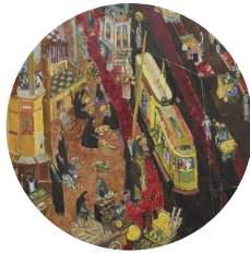
QUARTIER POPULAIRE Zeinab Abd El Hamid EGYPT