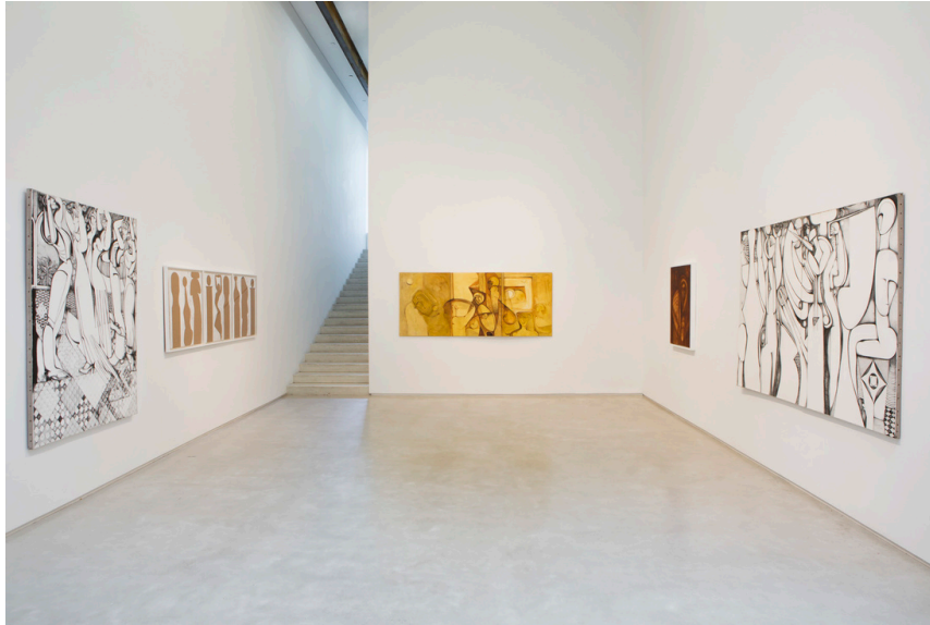
Installation view of "Ibrahim El-Salahi: Alhambra" at Salon 94, New York.

At Salon 94, "Alhambra" features a collection of works inspired by the artist's recent travels in Andalucía; he was particularly taken by Granada and its Moorish fortress complex (which gives the show its name). Dynamic flamenco dancers surface across the show, in exacting ink drawings, spirited silhouettes painted on cardboard, and glowing oil paintings rendered in rich, warm earth tones. The works exude southern Spain's cultural signifiers, as well as its Islamic roots. "Alhambra" also features The Arab Spring Notebook , now showing in the U.S. for the first time, a book of 46 drawings that El-Salahi made in response to the events of Arab Spring in 2010–2011, one of several visual diaries he has created throughout his career.