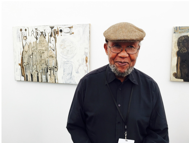
Ibrahim El-Salahi at Frieze NY 2015.

ARTSY EDITORIAL BY CASEY LESSER MAR 4TH, 2016 8:55 PM