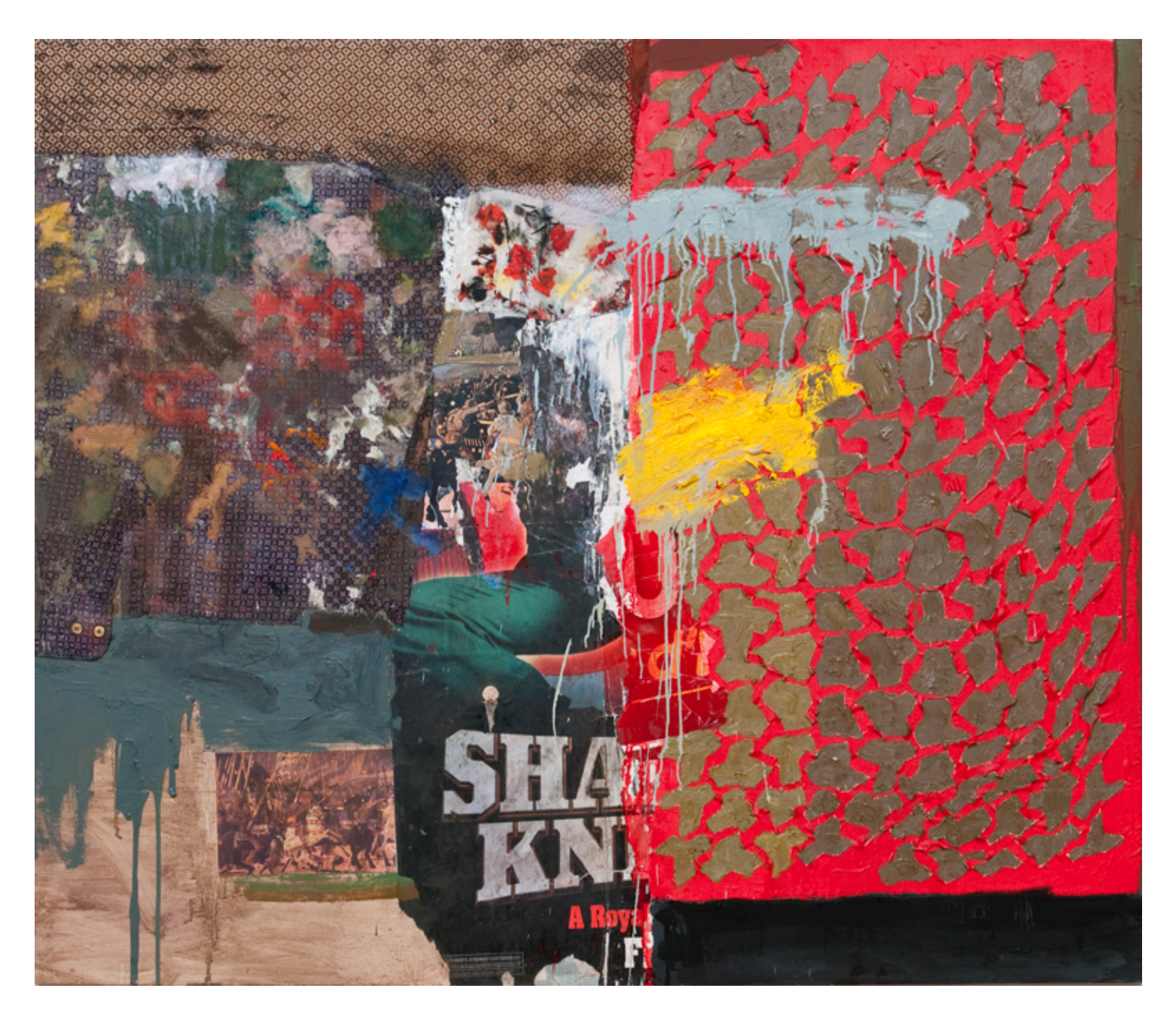
Paulo #1, 2011.