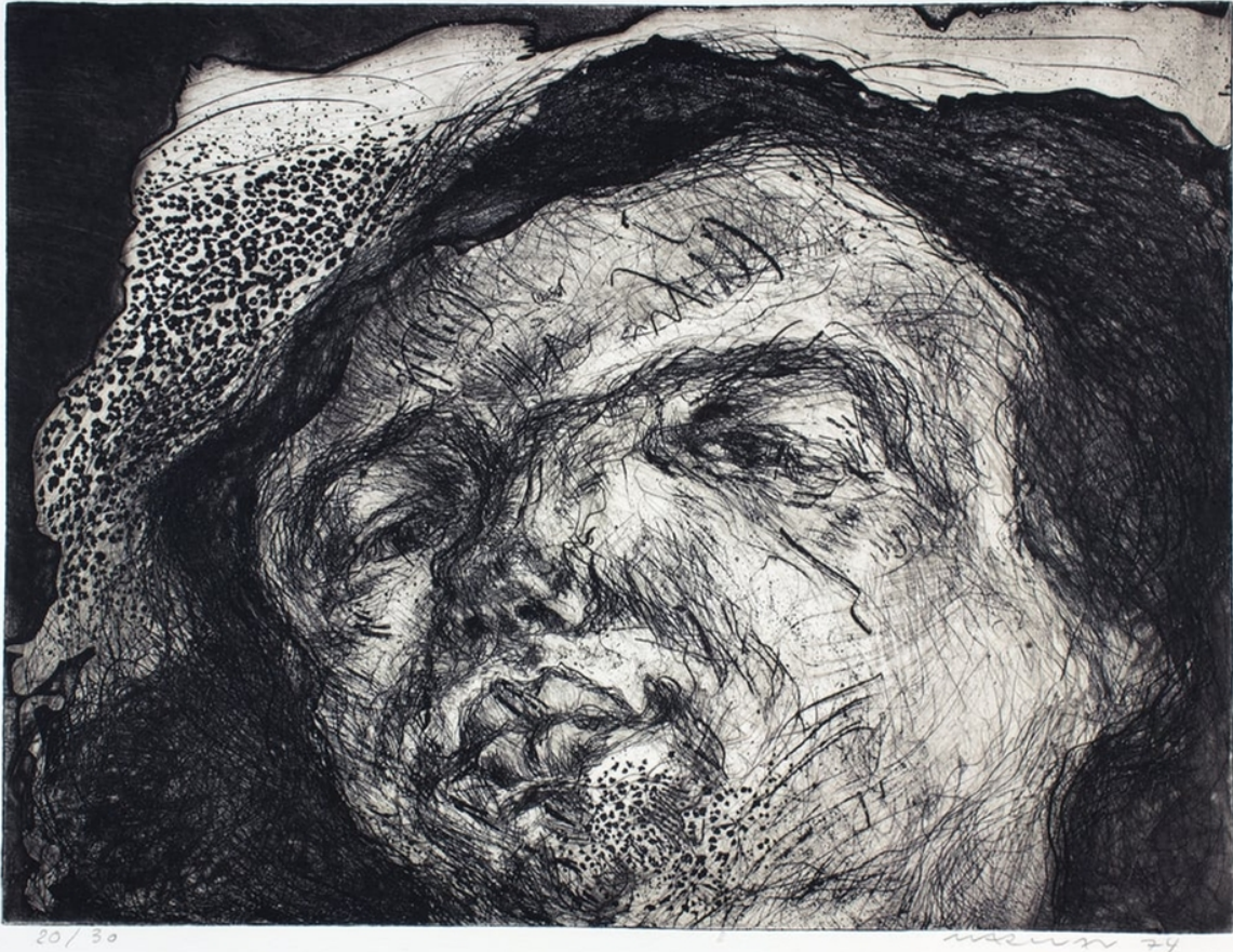
An untitled work by Marwan.