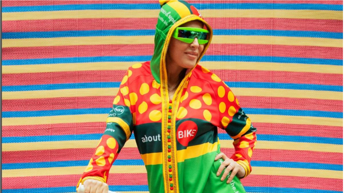
Hassan Hajjaj, 'Le Tour de Maroc'.

The annual art event developed its online catalogue and programmes after the coronavirus pandemic rendered a physical fair impossible