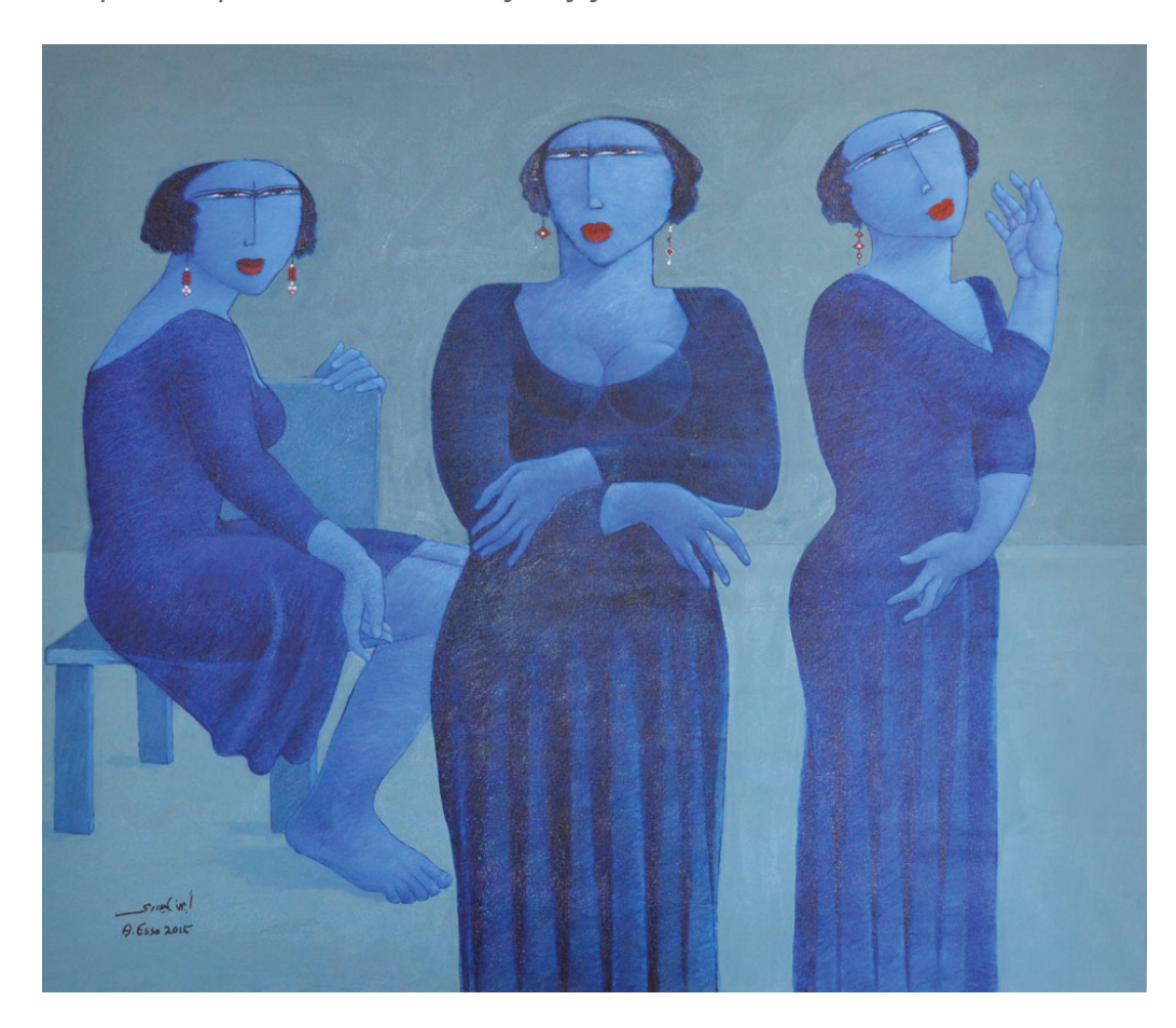
Photography: Courtesy of Foresight 32 Art Gallery and the artist

Advice for young artists: Words that we could all perhaps take to heart: "Be patient, persevere, and always try your best!"