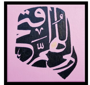
No. 10, 2015, 20 x 20 cm