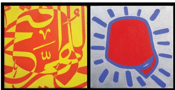
No. 3/4, 2015, acrylic on canvas, 20 x 40 cm