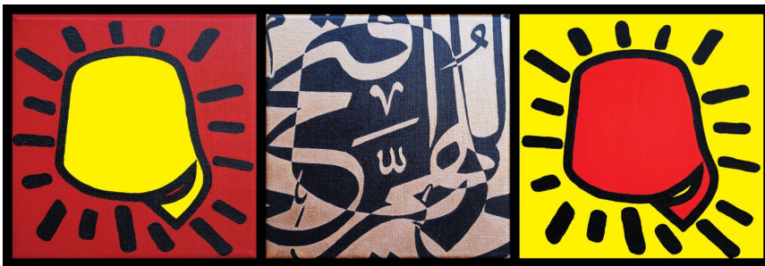
No. 7/8/9, 2015, acrylic on canvas, 20 x 60 cm (7.87 x 23.61 inch)