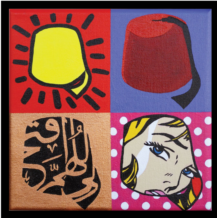
The Tarboush Chronicles no. 2, 2015, acrylic on canvas, 20 x 20 cm (7.87 x 7.87 inch)

“The individual has always had to struggle to keep from being overwhelmed by the tribe. If you try it, you will be lonely often, and sometimes frightened. But no price is too high to pay for the privilege of owning yourself.” Friedrich Nietzsche