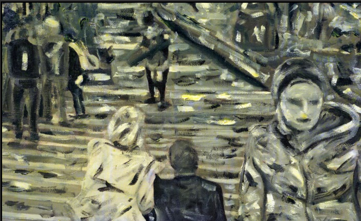
Marwan Chamaa, detail from NY-Cycles 3, triptych, 2016, oil on canvas, 55 x 225cm (21.65 x 88.58 inch)