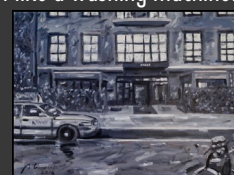
NY-Cycles 1, 2016, oil, 55 x 75cm

The cycles are as varied as the needs. The long cycle, the quick cycle, the delicate cycle or even a purely spin cycle. Depending on where you are in your life cycle, NY has a cycle for you. The challenge is though, choosing the right cycle for the right need, otherwise, you will not get the results desired.