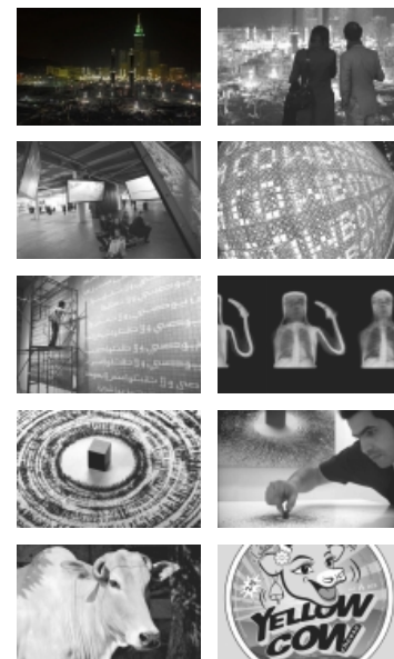
ARTIFICIAL LIGHT / DESERT OF PHARAN