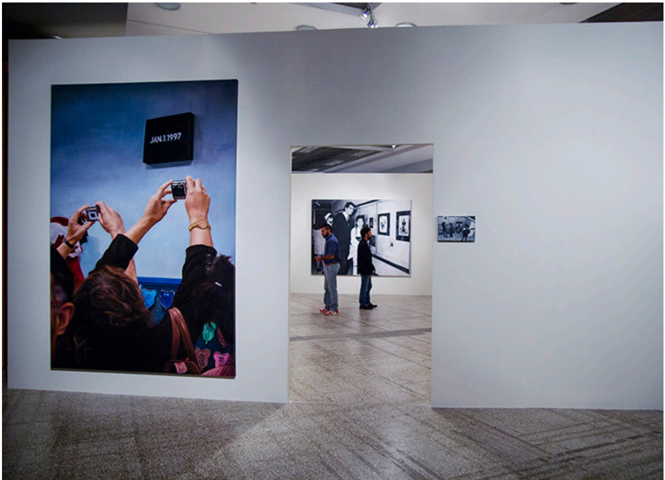
Khalil Rabah, "Art Exhibition," digital printing, 300x500 cm, 2016

Unlike Other Springs , on display at the Birzeit University Museum in the