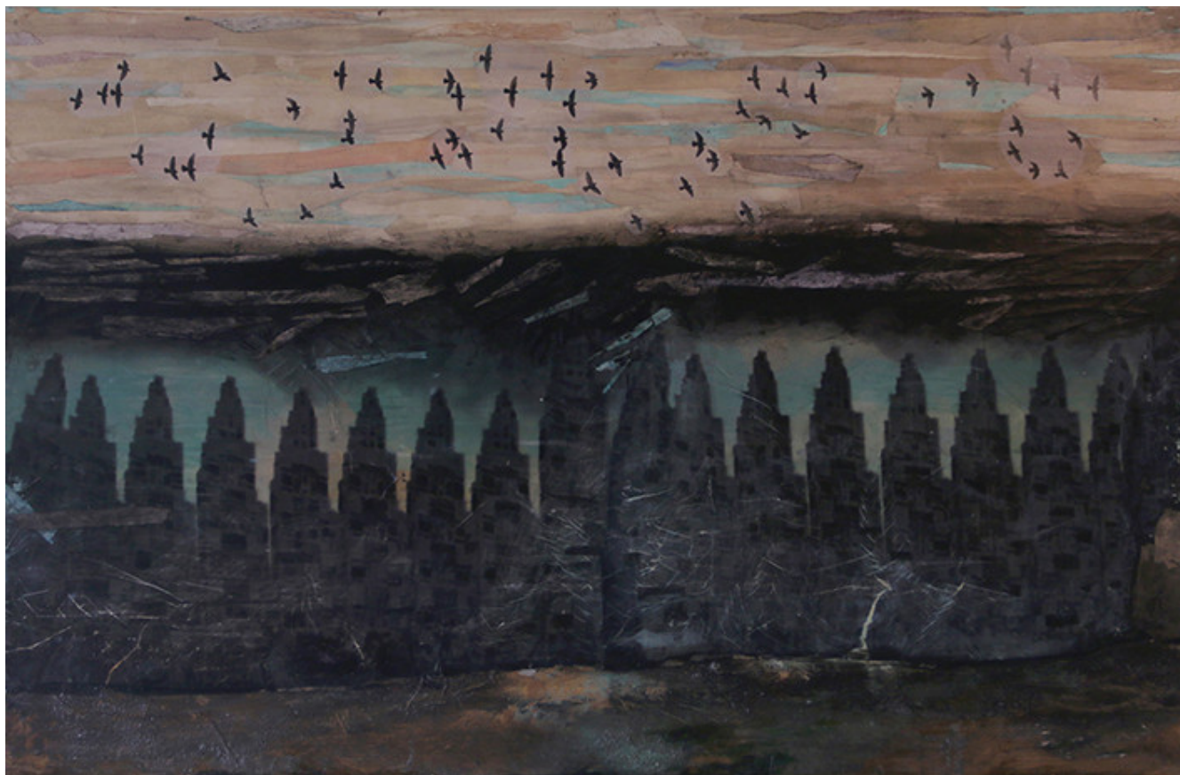
Inass Yassin, "Transformation #2," mixed media on canvas, 200x130cm, 2008

The exhibit also includes works by international artists, which — though gathered on a single wall in the gallery — form an integral part of the history of the museum.