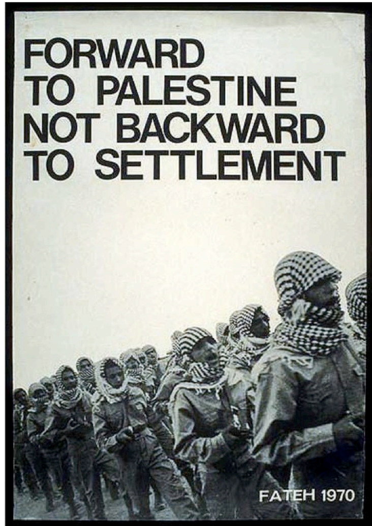
A poster from the dawn of the Palestinian liberation movement.

The Kalashnikov rifle, for example, featured prominently in material distributed by the Palestine Liberation Organization