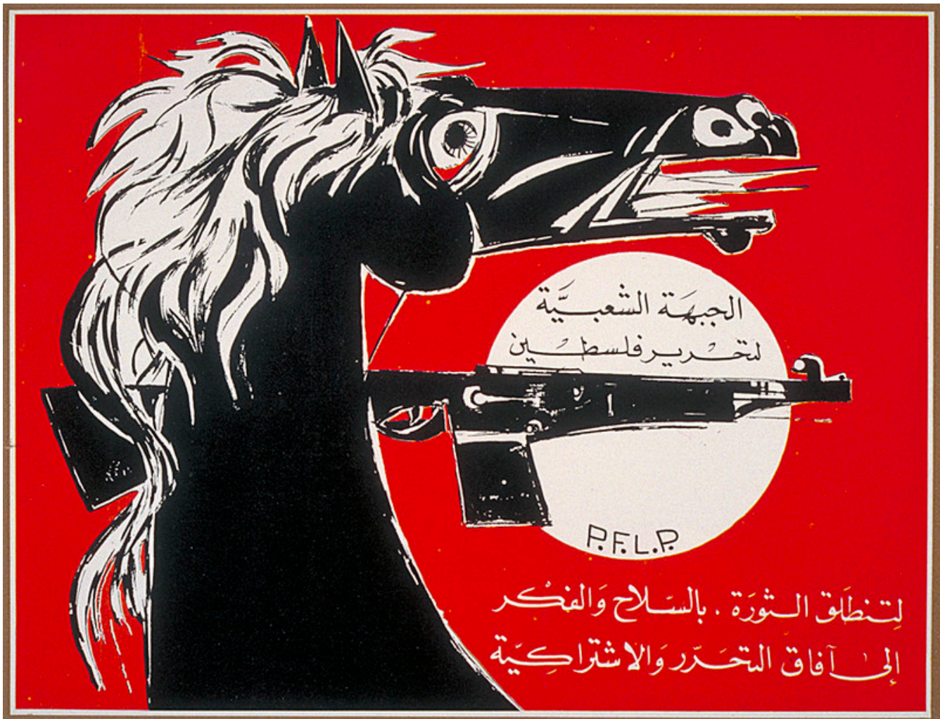
A poster produced by the leftist Palestinian faction PFLP in Lebanon in 1974.

A senior Palestinian Authority ( https://electronicintifada.net/tags/palestinian-