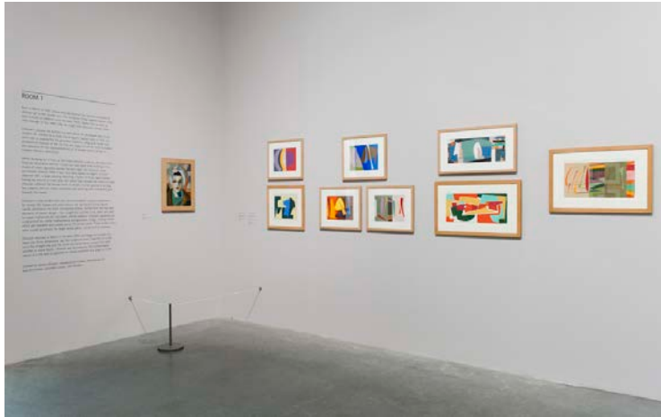
Installation views of Saloua Raouda Choucair's exhibition at Tate Modern, 2013.