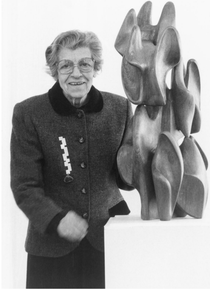
Saloua Raouda Choucair.