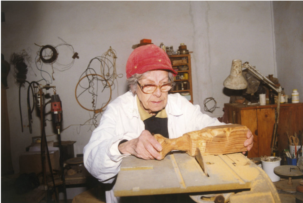
Saloua Raouda Choucair.

Lorena Muñoz-Alonso ( https://news.artnet.com/about/lorena-mu%C3%B1oz-alonso-199 ), January 31, 2017