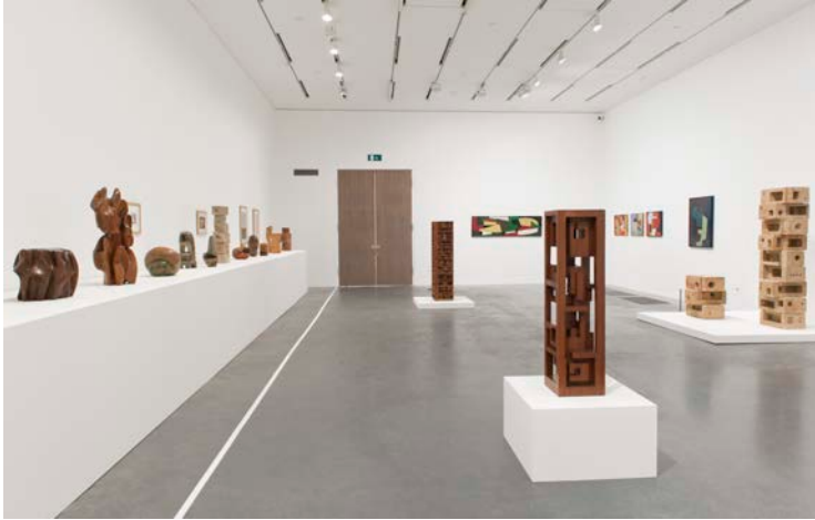
Installation views of Saloua Raouda Choucair's exhibition at Tate Modern, 2013.

influence in her oeuvre (she was also interested in Modernist architecture, with Le Corbusier ( http://www.artnet.com/artists/le-corbusier/ ), being a favorite).