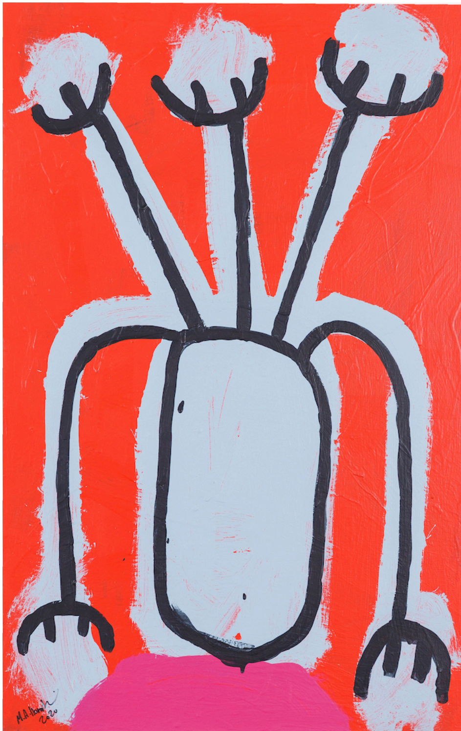
Mohamed Ahmed Ibrahim, Untitled, 2020, Acrylic on canvas, 82 x 52 cm.