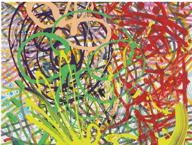
Abdullah Qandeel b. 1988