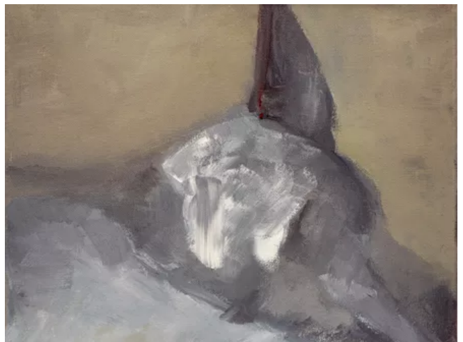
Zamir Shatz Israeli, b. 1969