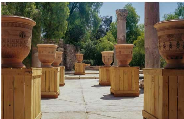
Lettres d'argile; Hommage à Ibn'Arabi - Letters of Clay; homage to Ibn Arabi, 1998.