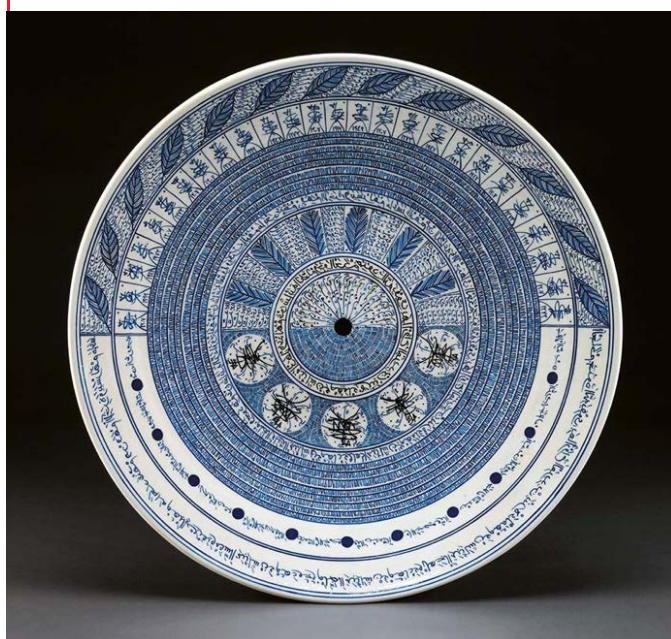
Rachid Koraïchi , Path of Roses , 2001. Porcelain vessel, 55 x 55 x 8 cm.

Collection of the British Museum (Purchased with the assistance of the Art Fund).