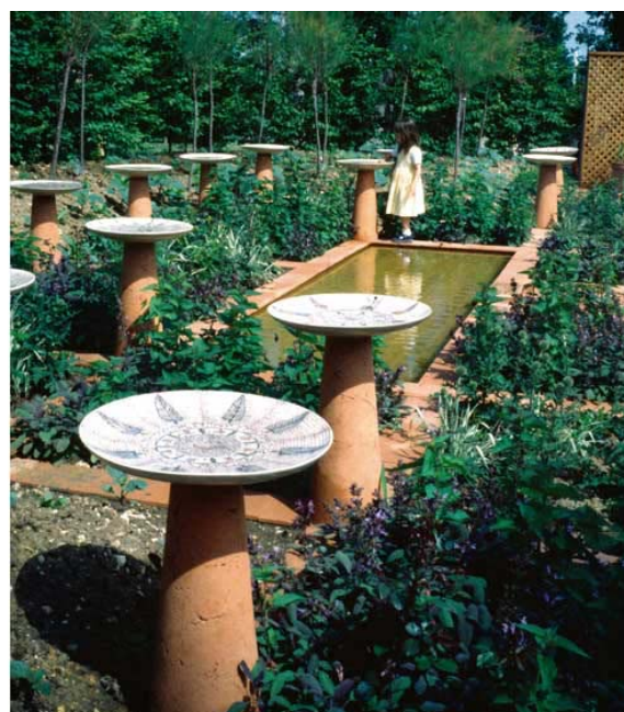
Les Jardins du Paradis - Gardens of Paradise, 1998.