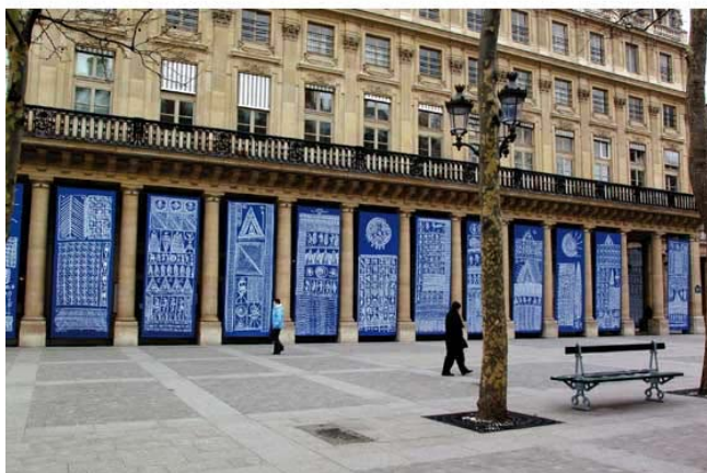
Fragments d'Écriture - Fragments of Script, 2003.