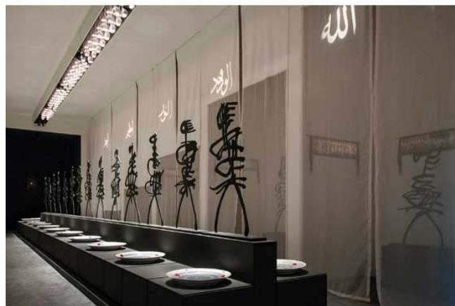
Path of Roses - Le Chemin des Roses, complete installation, 1995-2005.