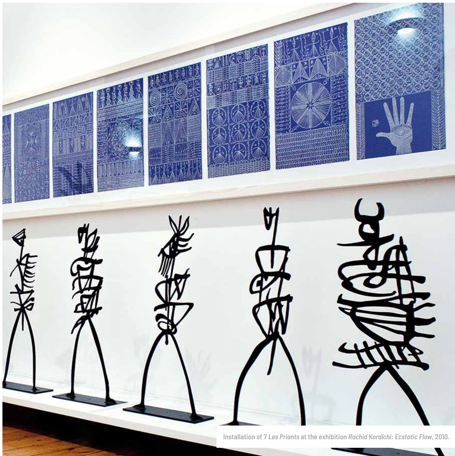
Installation of 7 Les Priants at the exhibition Rachid Koraïchi: Ecstatic Flow , 2010.