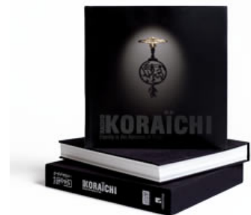
Very limited edition Rachid Koraïchi monograph available for purchase from our bookstore