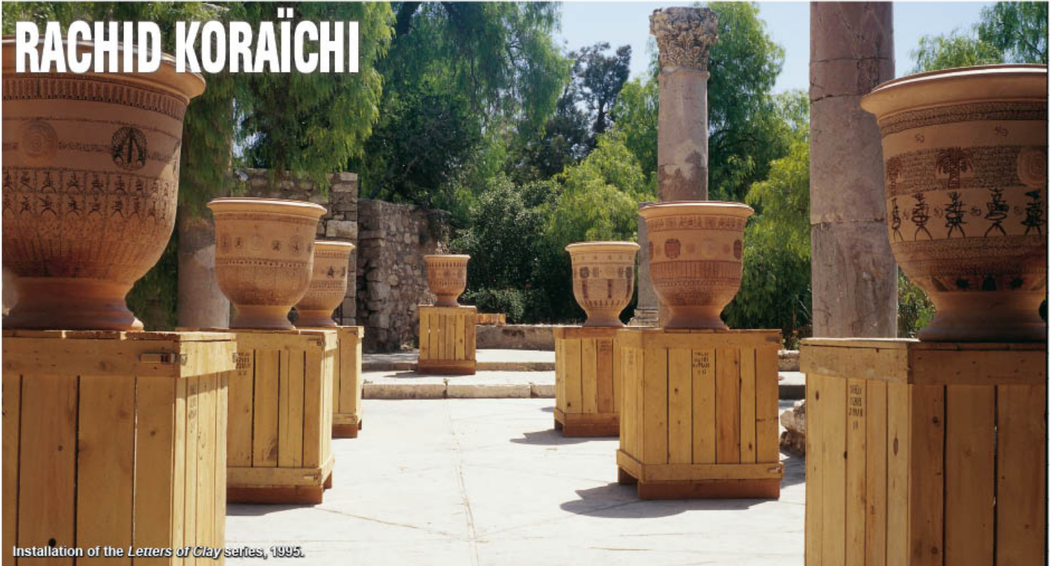
Installation of the Letters of Clay series, 1995.

Founded in 1979, October Gallery, in central London, exhibits innovative, contemporary art from around the world. For over 35 years, October Gallery has pioneered the development of the Transvanguard - the trans-cultural avant-garde.