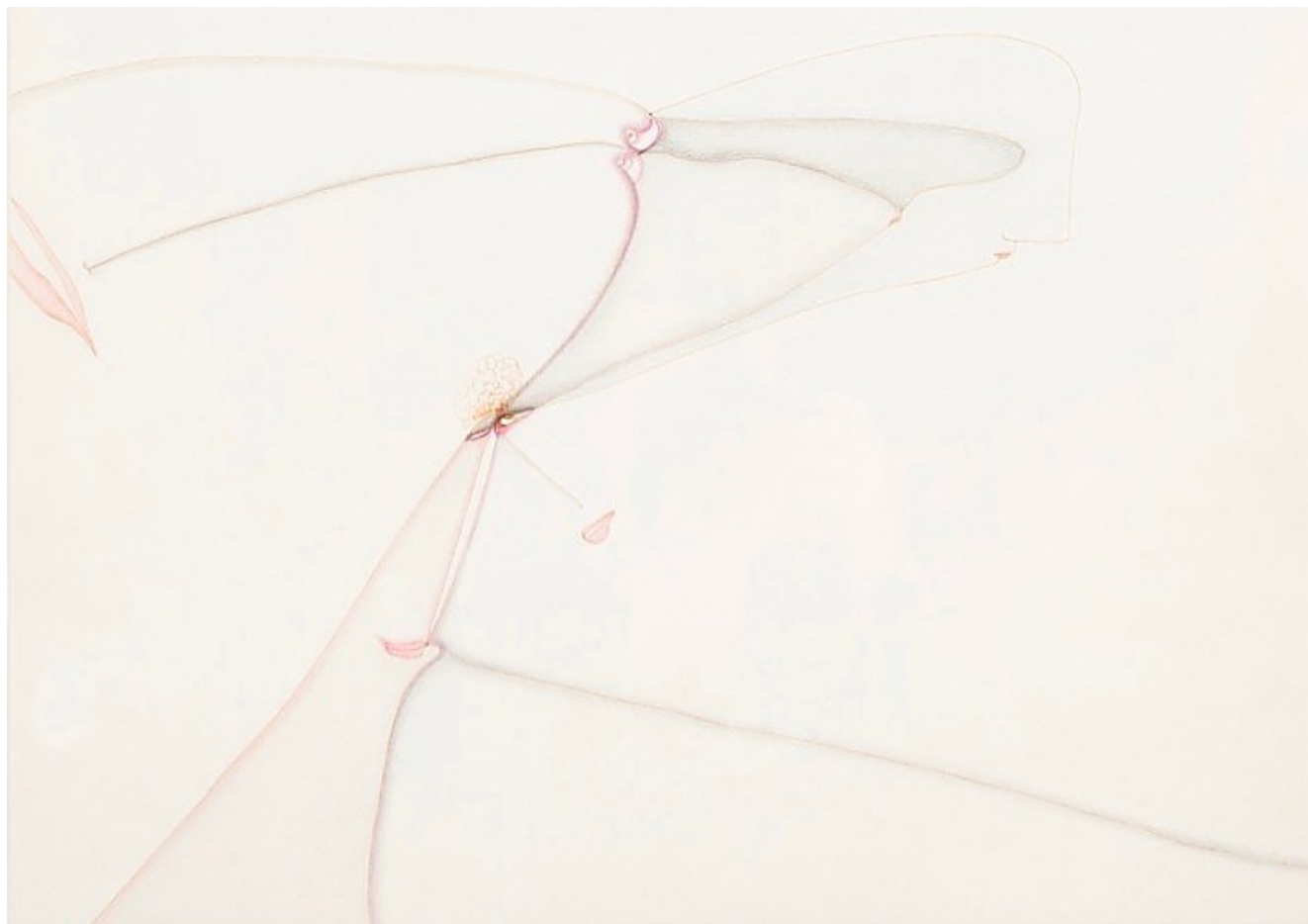
Huguette Caland, "Erotic Composition," 1967-70, ink and graphite.

In some cases, European methods are employed in innovative ways. Huguette Caland's "Erotic Composition" is a play on European modes of surrealism. With a few tiny red and pink curvilinear forms, Caland suggests labia, lips, eyes. Large gray areas in pencil make a veil pulled apart in many directions. The female figure is at once covered and uncovered.