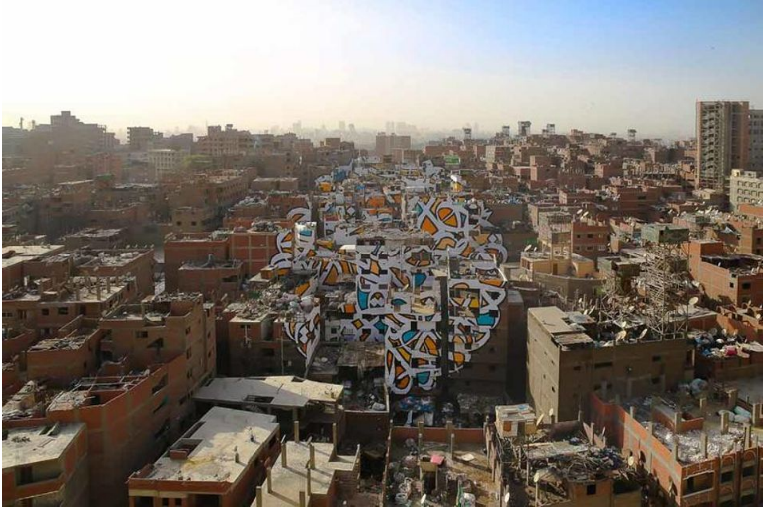
eL Seed's anamorphic work Perception (2016) in Cairo

The artist will sell an edition of 49 lithographs from the original artwork on his website ↗ , with half of the proceeds going to the hospital of Boulogne-Billancourt, where he grew up in France, and the other half to hospitals in Gabes, the Tunisian city where his family are originally from.