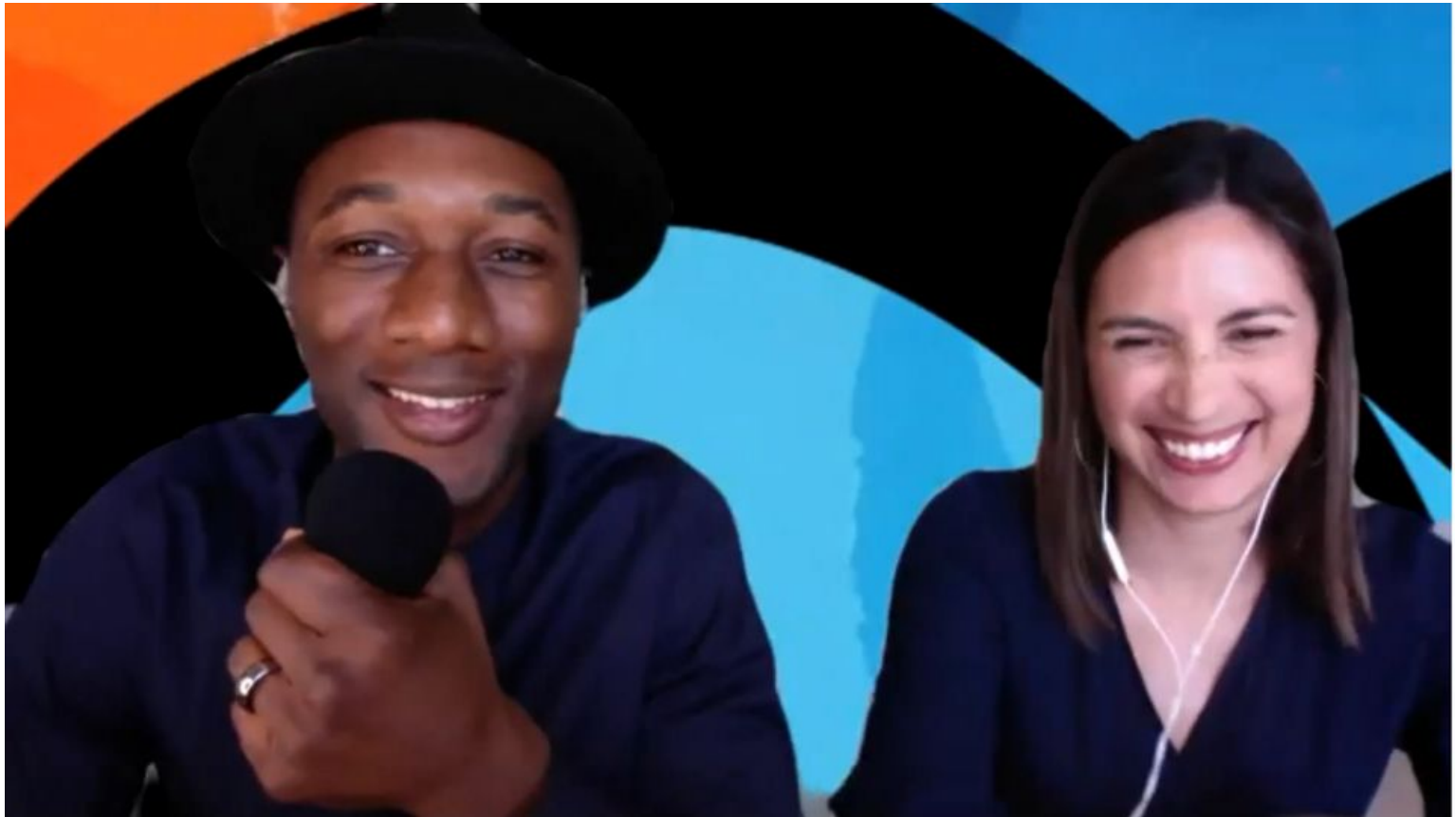
The musical partners Aloe Blacc and Maya Jupiter performed for the participants

Creating the collage raised many technological complications given that chat participants are ordered seemingly at random when displayed in "gallery view" during a Zoom video call. eL Seed says he had to study the logic of the platform to work out where each participant would be placed in the 49-screen layout. He then digitally divvied up the print and sent the apportioned "piece" to each person to use as a virtual background, a function available on Zoom that allows a user to change the background against which they appear to an image of their choosing.