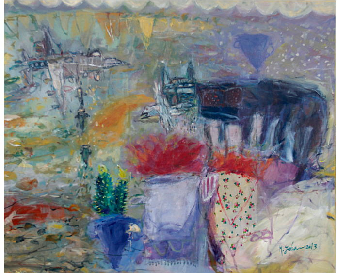
Mohammed Joha, Crime Scene , Series #1, 120x100 cm, acrylic on canvas, 2013.

The painting's title challenges us to wonder if this is a crime. What does it mean for the struggle for life and death to take place among the colors of paradise?