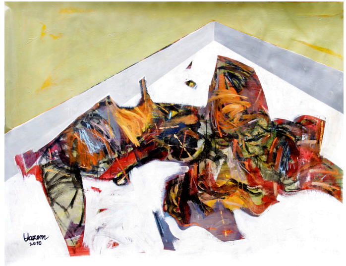
Hazem Harb, Invisibility #5 , 200x160 cm, mixed media on collage on canvas, 2010.

The largest piece from the Invisibility series stands out in the farthest corner of the gallery, instantly drawing the eye as soon as one enters the museum's foyer. This might also be a semi-creature hauling itself across a sparse room. But in this painting the "creature" seems to have been painted first and the white walls and floor added afterwards.