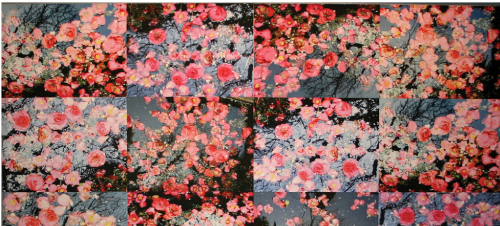
Camellia 3, 2015, Digital print on Japanese paper