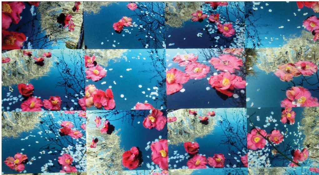
Camellia 4, 2015, Digital print on Japanese paper