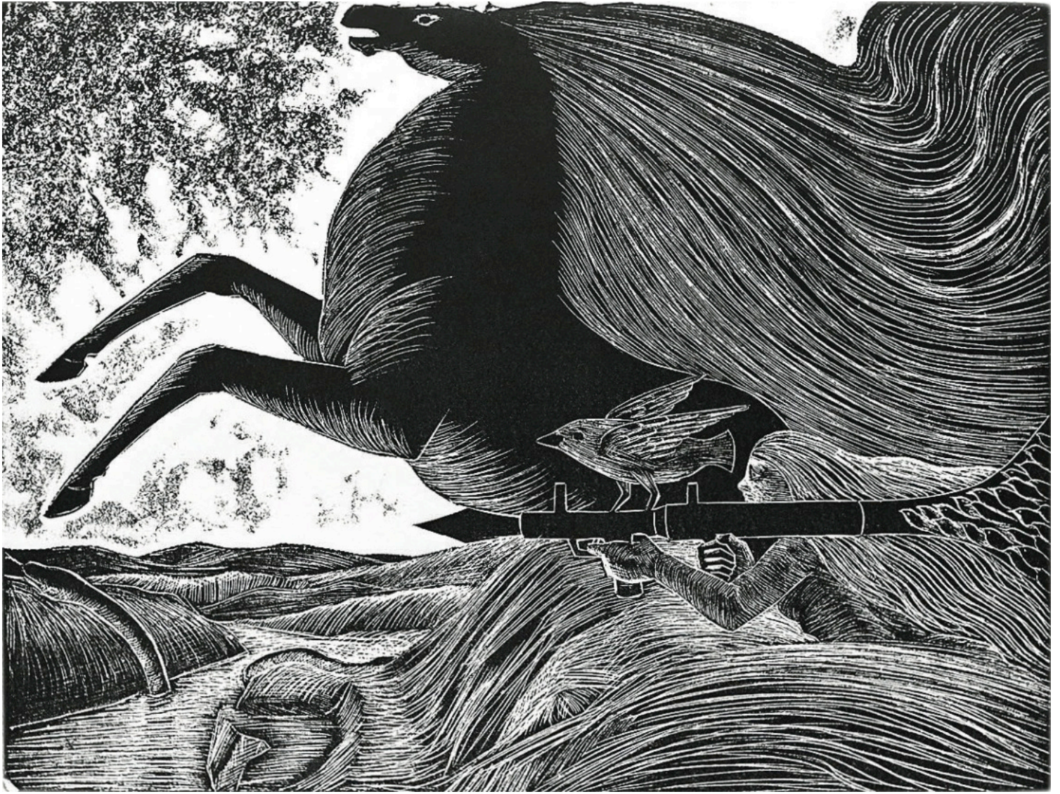
[Mustafa al-Hallaj, "Battle of Karamah" (1969).]