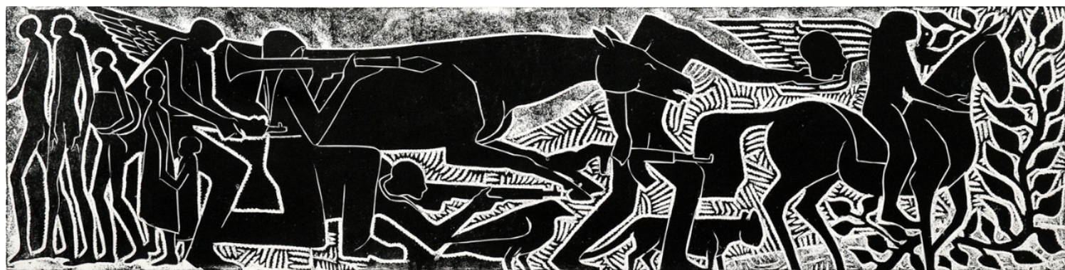
[Mustafa al-Hallaj, untitled (1980). Image copyright the artist's estate.

juxtaposition of images abound. In his prints, images of people, animals, and objects are flattened, their contours simplified, and their details removed; then they are arranged in rows in order to relate a visual story. Throughout his work, the background shapes between images, which establish negative space, are just as carefully crafted as the foreground ones that create positive space. In this, the influences of ancient Egyptian bas-relief and of Arabic calligraphy are clearly apparent given that both possess this attribute. The impact of both in Mustafa's work dates back to his time in Luxor. An excellent example of these elements is a 1980 print that shows a row of people of all ages, weapons, and symbolic animals moving forward. It is not a group of modular soldiers of some national army but rather a social group surging forth in revolutionary struggle.