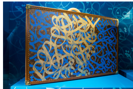
( https://elseed-art.com/wp-content/uploads/2018/04/Louis-Vuitton-eL-Seed-Collaboration-page4.jpg )

eL Seed ( https://en.vogue.me/?p=15237 ) has teamed up with the French luxury Maison, Louis Vuitton, for the second time to customize the brand’s iconic monogram trunk.