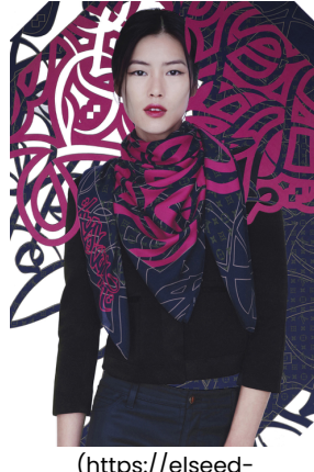
( https://elseed-art.com/wp-content/uploads/2018/04/eLSeed_LouisVuitton.jpg )