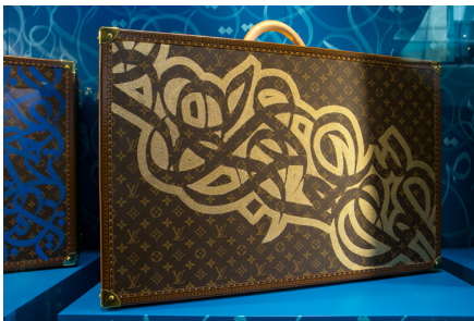
( https://elseed-art.com/wp-content/uploads/2018/04/Louis-Vuitton-eL-Seed-Collaboration-page5.jpg )