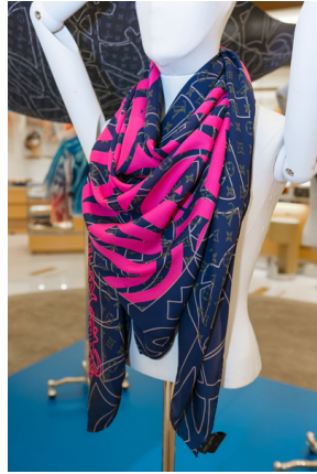
( https://elseed-art.com/wp-content/uploads/2018/04/Louis-Vuitton-eL-Seed-Collaboration-page6.jpg )