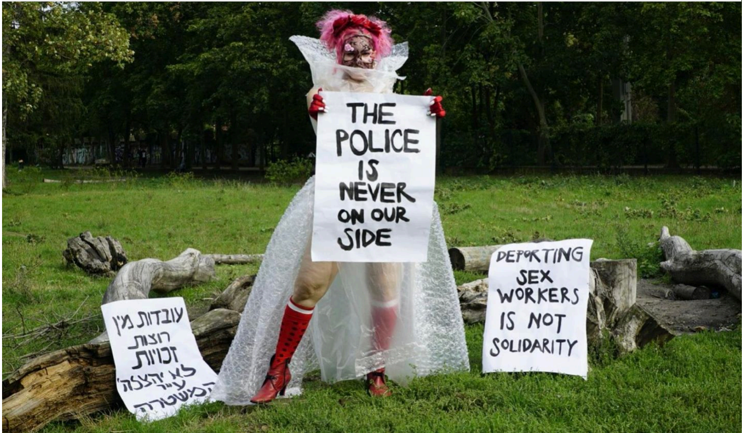
Liad Hussein Kantorowicz, Mythical Creatures (2020) (still). Film. 17 min 35 sec.