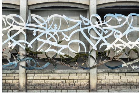
( https://elseed-art.com/wp-content/uploads/2018/04/1-2.jpg )