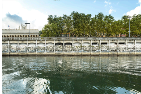
( https://elseed-art.com/wp-content/uploads/2018/04/2-1.jpg )

◀ PREVIOUS PROJECT ( HTTPS://ELSEED-ART.COM/PROJECTS/LOUIS-VUITTON/ )