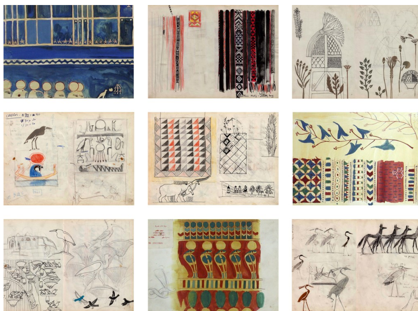
Sketches 1972-1982, 2016. Dibond, edition of three