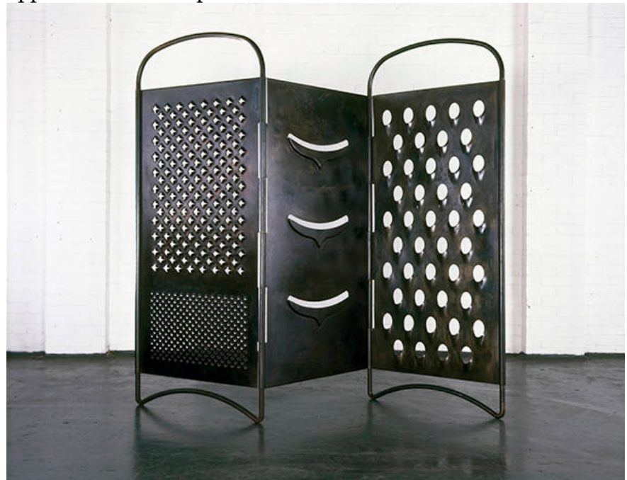
Mona Hatoum's 'Grater Divide' (2002).

makes her the daughter of Meret Oppenheim and Louise Bourgeois, feminist artists who also turned the tools of their oppression into weapons.