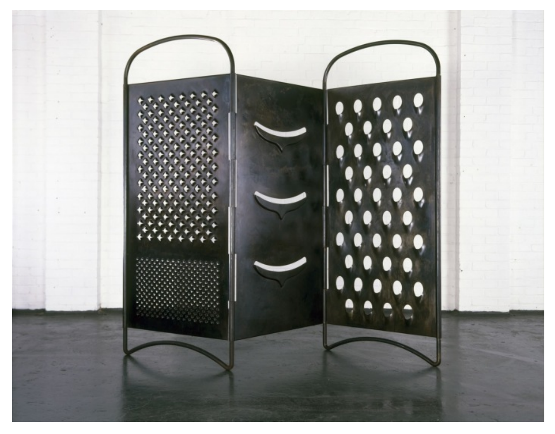
Mona Hatoum Grater Divide 2002 © Mona Hatoum

daughter, 'it also speaks of exile, displacement, disorientation and a tremendous sense of loss as a result of the separation caused by war.