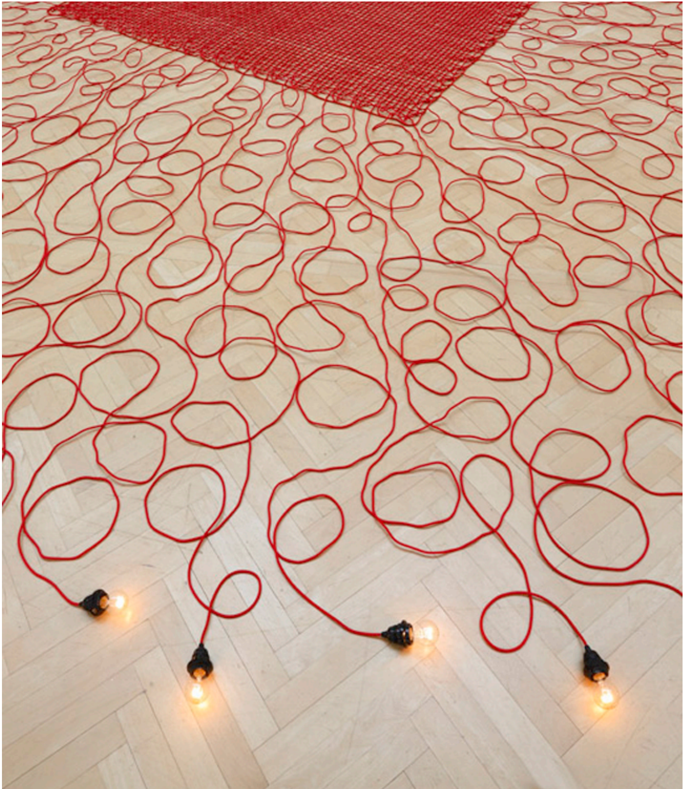
Mona Hatoum, Undercurrent (red) , 2008. Detail.

On an internal level, turbulence echoes the artist's questioning of self vis-à-vis one's grappling with issues of alienation and displacement . Externally, it is a reflection of her interrogation of notions of belonging and collective memory . And finally, on a formalistic level, turbulence can be seen as resulting from the