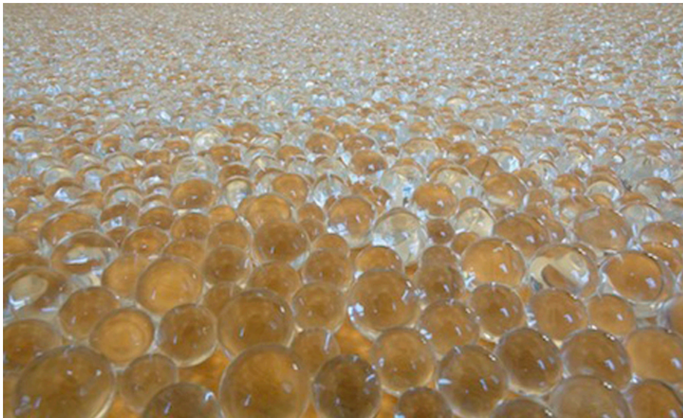
Mona Hatoum, Turbulence (detail) , 2012.

artist's ongoing inquiry into ways of expanding the formal and material qualities of artistic expression.