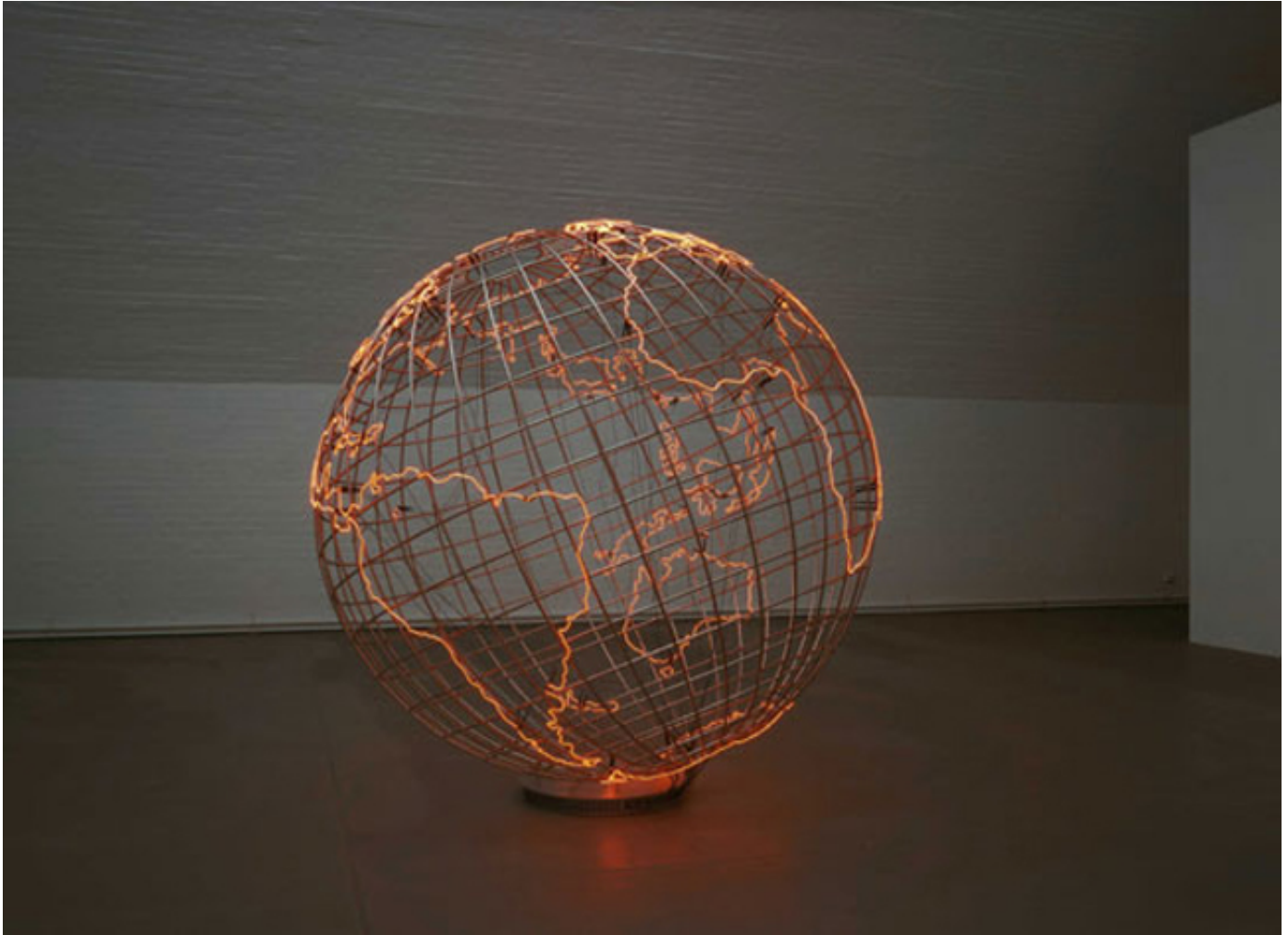
Mona Hatoum, Hot Spot 2006.

Placed exactly at the centre of the exhibition, this installation lies at the heart of a linear but non-chronological trajectory whereby a number of unexpected juxtapositions echo the complexity through which the artist has managed to challenge, and at times disturb, our experience of the ordinary. The choice of the notion of turbulence as a conceptual framework for the exhibition is derived from the thematic and formal dichotomies inherent within the artist's work. These render it familiar yet perplexing, allowing for an intense aesthetic experience that is both inviting yet impenetrable, or, in other words, turbulent .