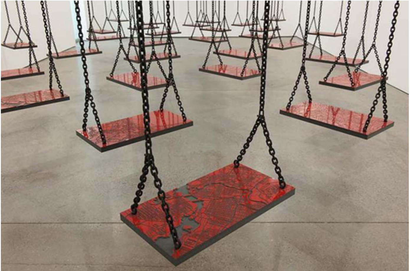
Mona Hatoum, Suspended , 2011.