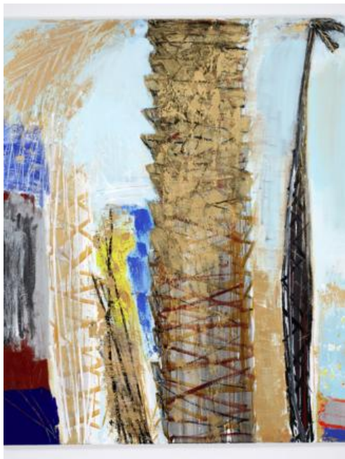
Nabil Nahas: Untitled , 2014, acrylic on canvas, 72 by 60 inches.

by Iphgenia Baal (/Search/Iphgenia+Baal/)