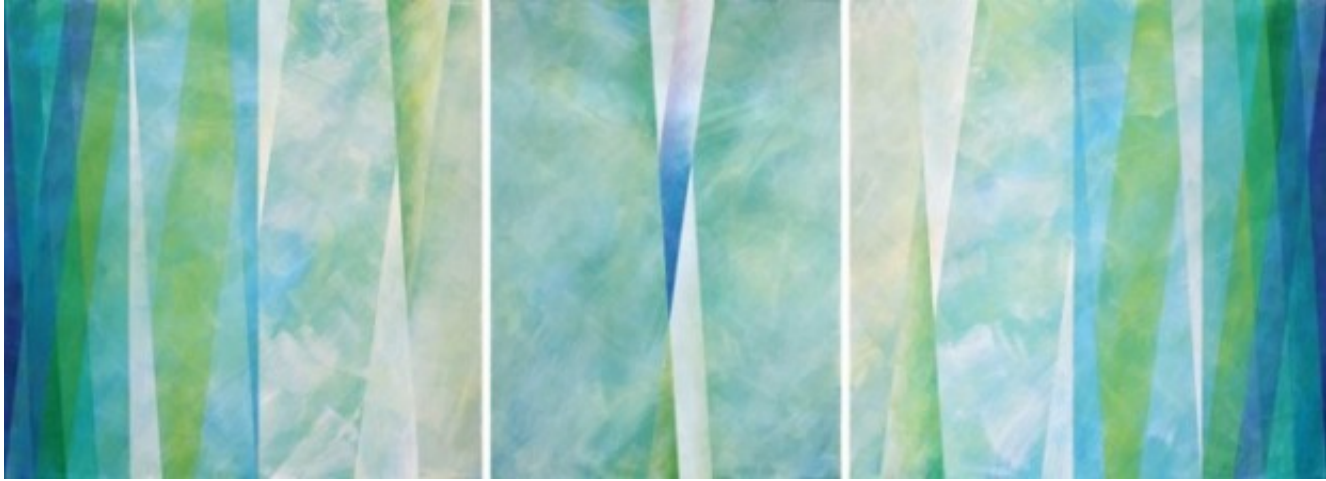
Bilqis 5 (Acrylic on canvas, 120 x 328 cm, 2014) by Kamal Boullata, featured from the Barjeel Art

Foundation ( https://www.barjeelartfoundation.org/collection/bilqis-5-kamal-boullata/ ) website.