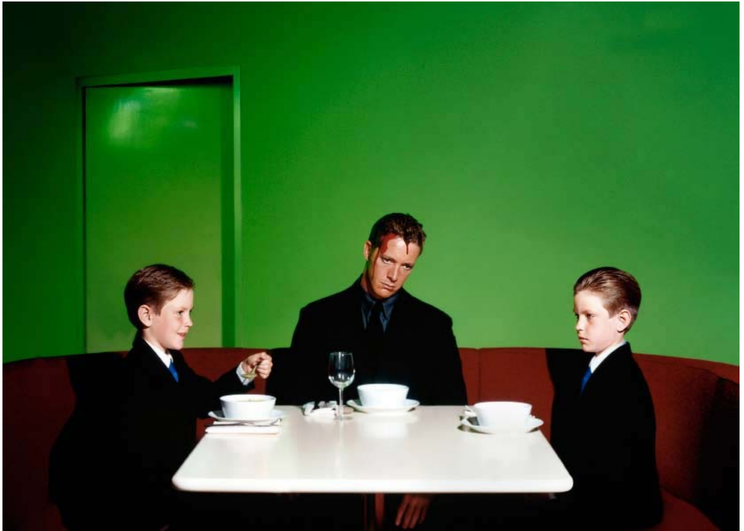
Mitra Tabrizian , Untitled (Twins) , from the series Beyond the limits , 2000-01, Kodak c-print, ed. of 5, 122 x 152 cm, copyright Mitra Tabrizian and Galerie Caprice Horn

(Kiki)" of 1926. So there are semantic pathways leading to the complex conceptions of the woman as the muse and the woman as the source of the power of life, associating the two in an interpretation of the structural similarities between natural and artistic creation.