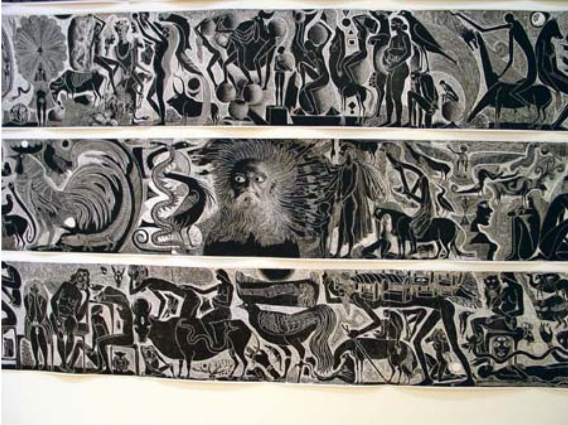
Figure 4. Mustafa Al Hallaj (in detail)