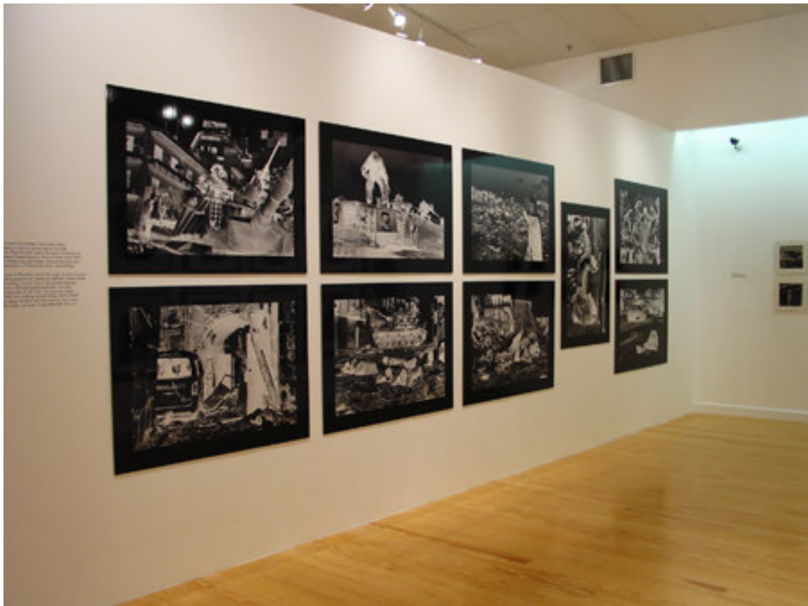
Figure 1. Rula Halawani

“Made in Palestine” debuted at the Station Museum of Contemporary Art, Houston, [May 3-Oct. 3, 2003]. It traveled to SomArts Cultural Center, San Francisco [Apr. 7-22, 2005]; T.W. Wood Gallery and Arts Center, Montpelier, Vt. [Oct. 18-Nov. 20, 2005]; and The Bridge Gallery, New York [Mar. 14-May 27, 2006].