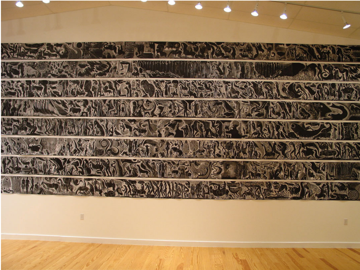
Figure 3. Mustafa Al Hallaj