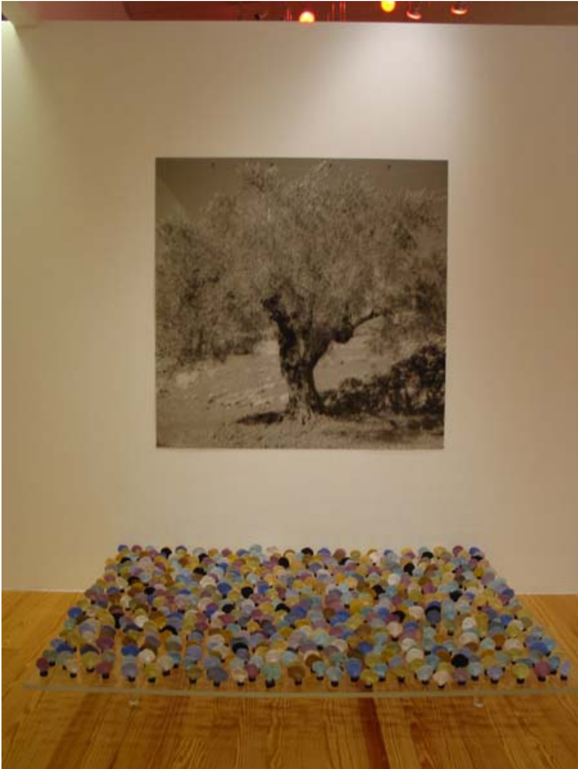
Figure 2. Vera Tamari