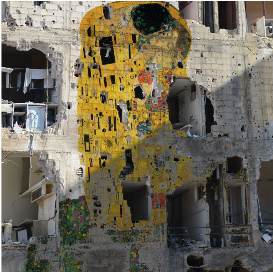
Tammam Azzam, 'Syrian Museum – Gustav Klimt's "The Kiss" (Freedom Graffiti)', 2013, lightbox, edition of 5, 75 x 75 cm.