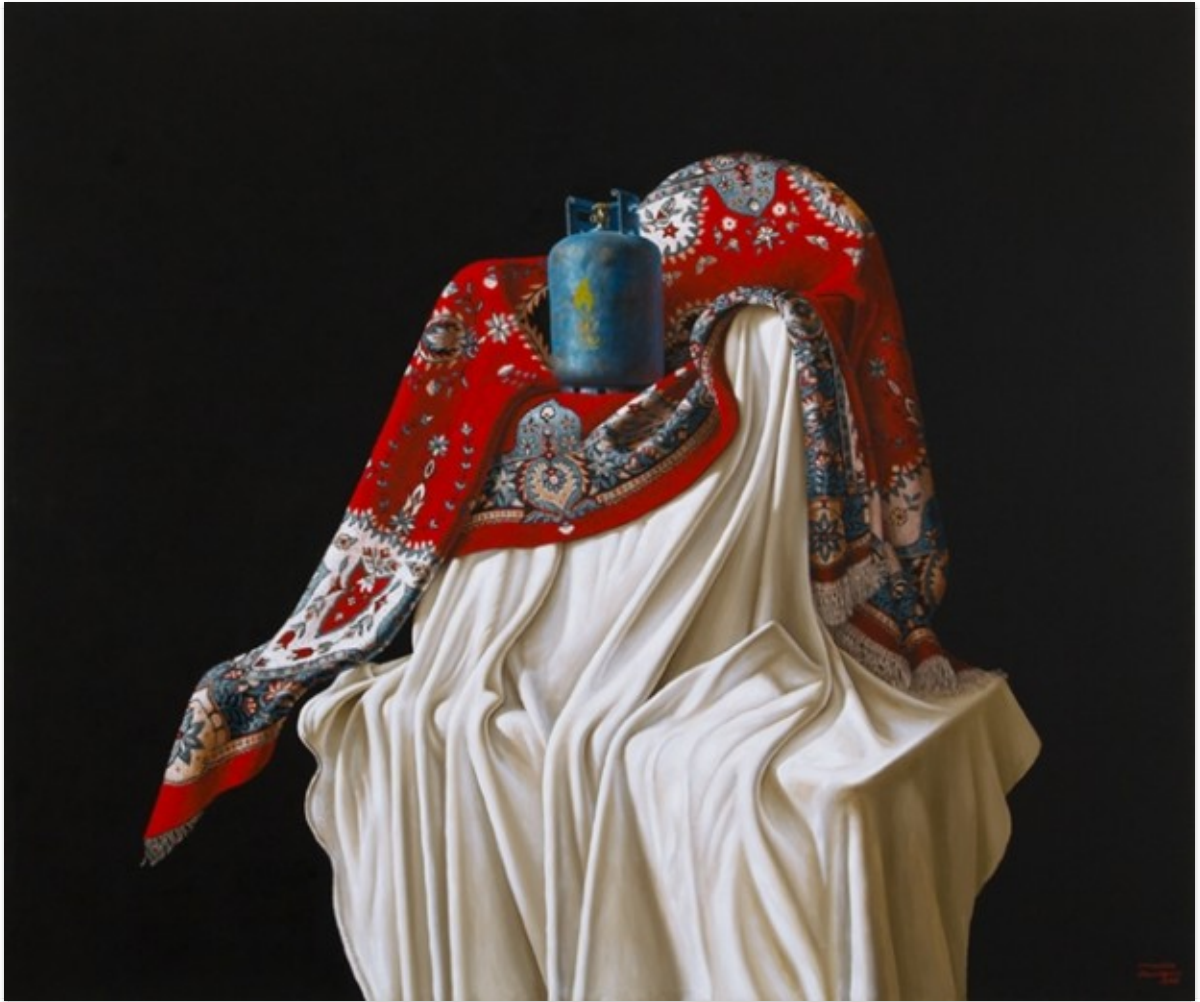
Othman Moussa, 'The King 2', 2011, oil on canvas, 150 x 180 cm.