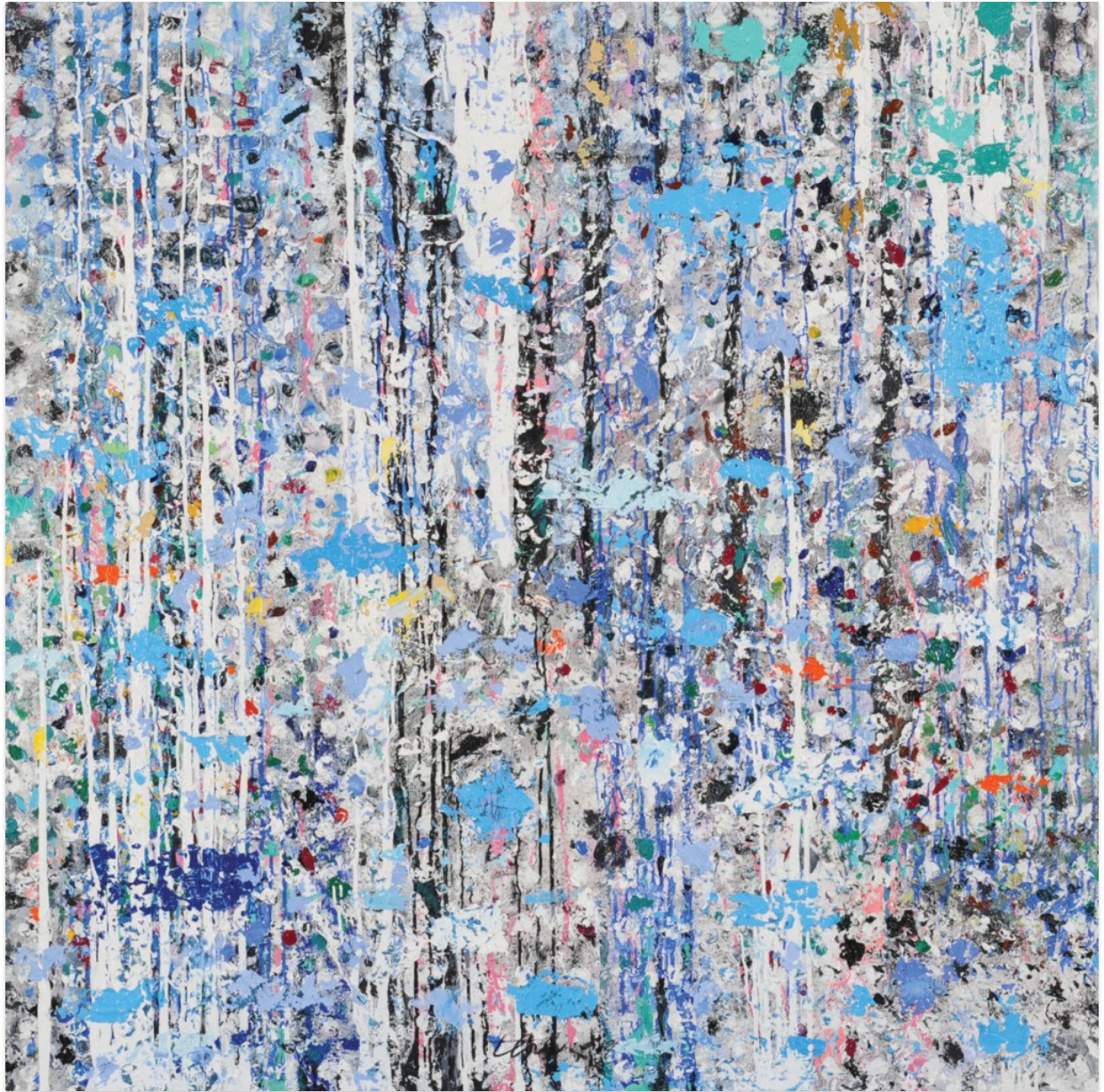
Thaier Helal, Untitled, 2009, mixed media on canvas, 180 x 180 cm. Image courtesy Ayyam Gallery.