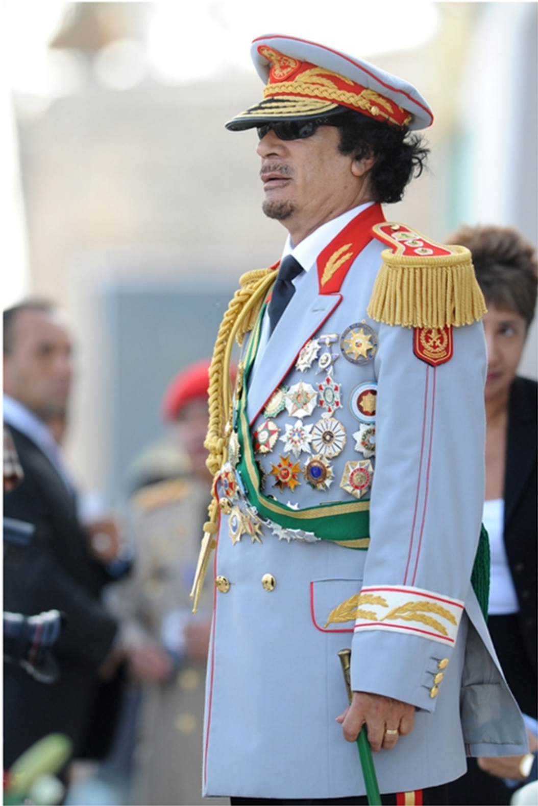
'Libyan leader Muammar Gaddafi seen prior to a military parade organised at