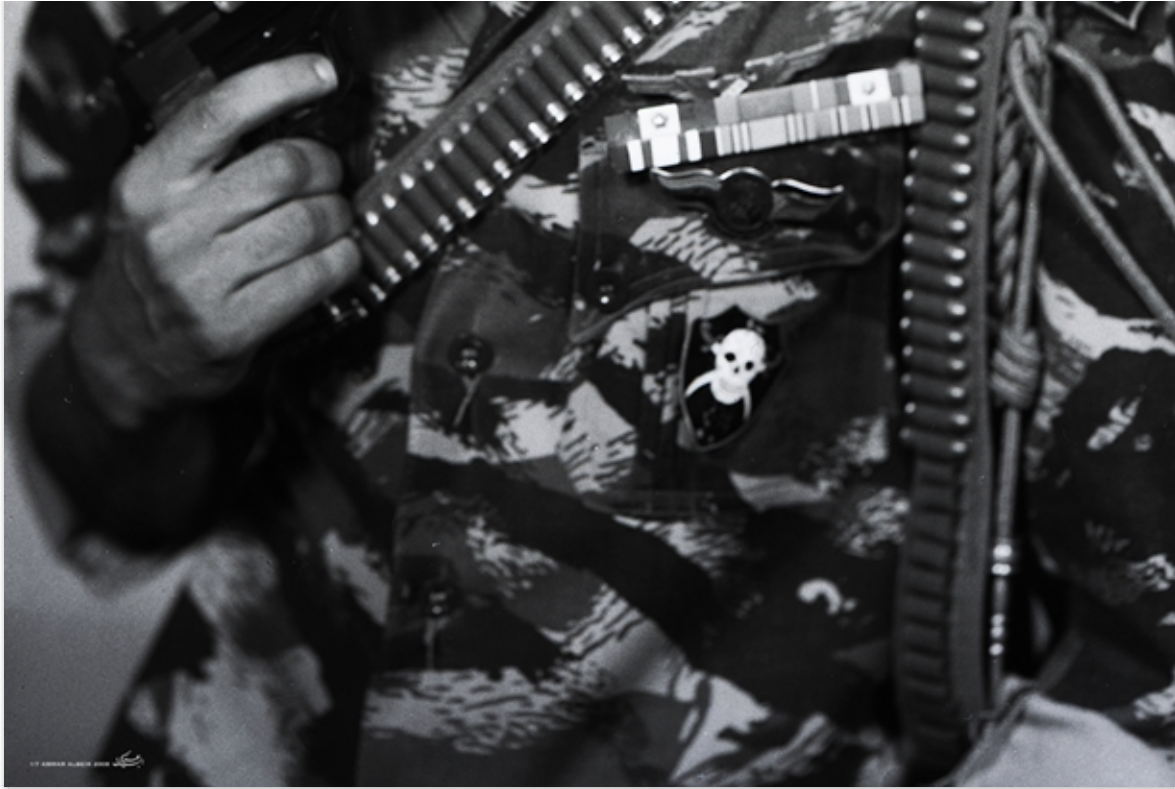
Ammar Al-Beik, 'Adam', 2008, UltraChrome ink print on fine art paper, series of 7, 180 x 110 cm.