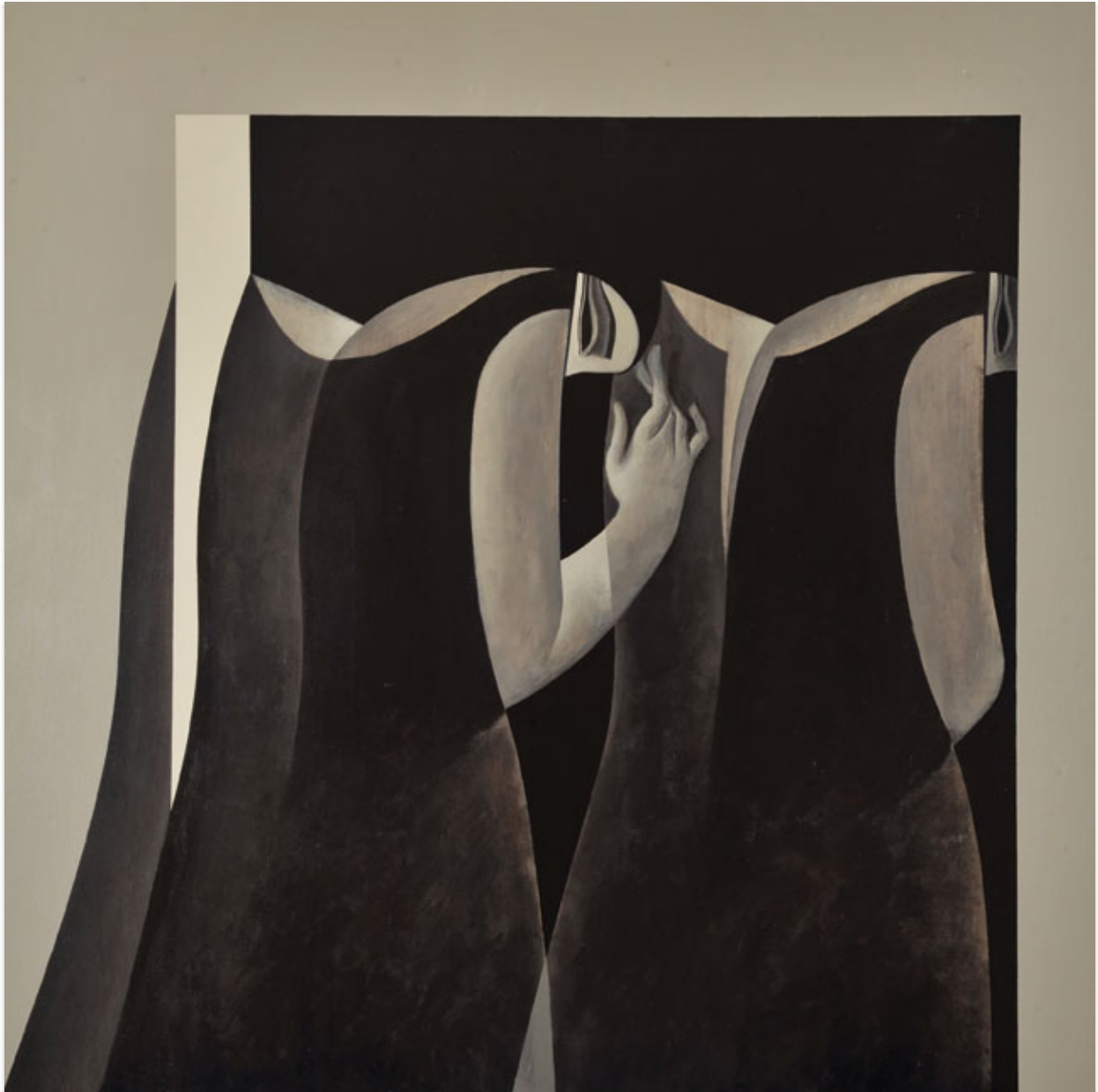
Safwan Dahoul, 'Dream 19', 2009, acrylic on canvas, 180 x 180 cm.