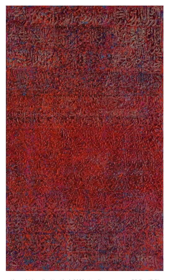
Ahmad Moualla, Untitled, 2009, Acrylic on canvas, 78.7 \times 47.2 " Inquire