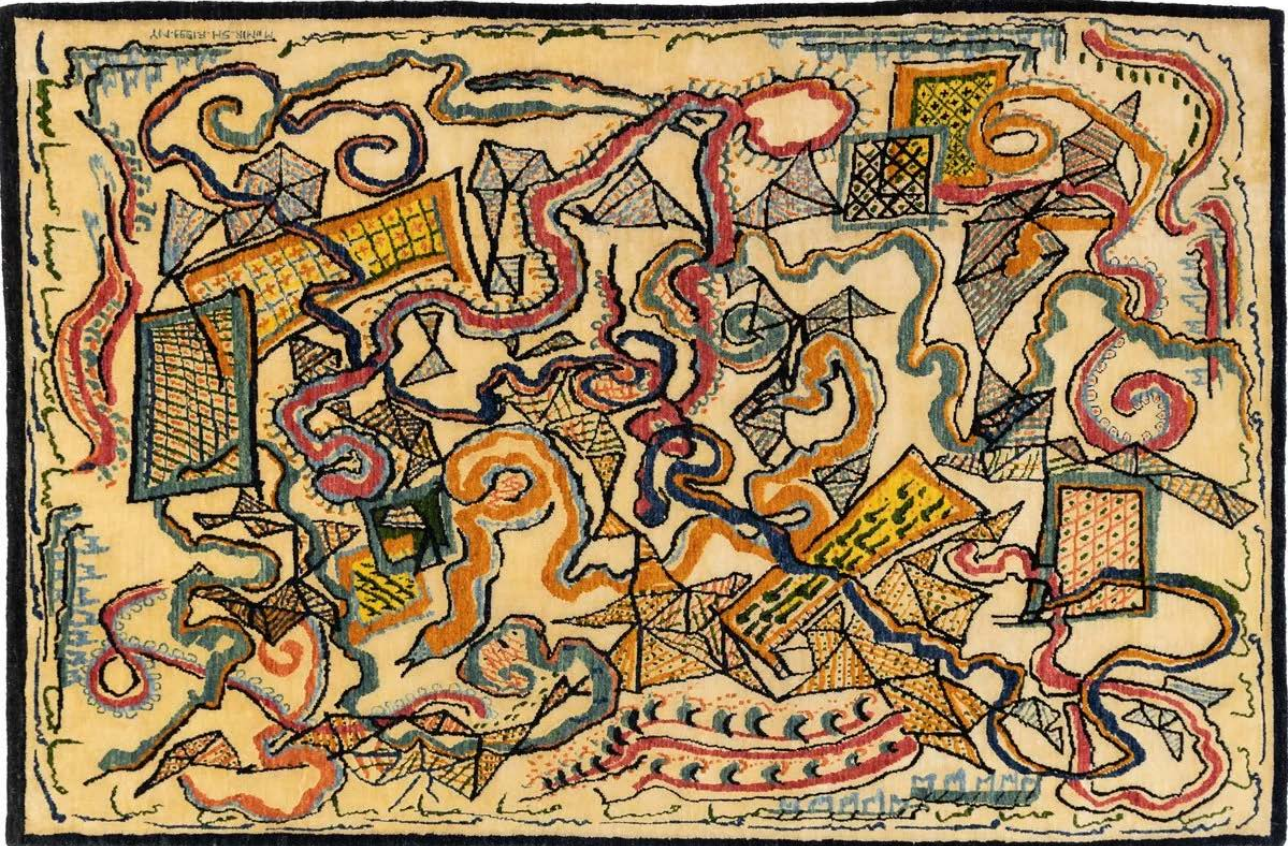
Monir Farmanfarmaian, "Untitled (C5)" (1993-2009).

“In one of the Zoom calls, which included all of the galleries in Al-Serkal Avenue, the idea of an auction to support the galleries and their artists was mooted, with a charitable component to benefit vulnerable people made even more disadvantaged by COVID-19.”