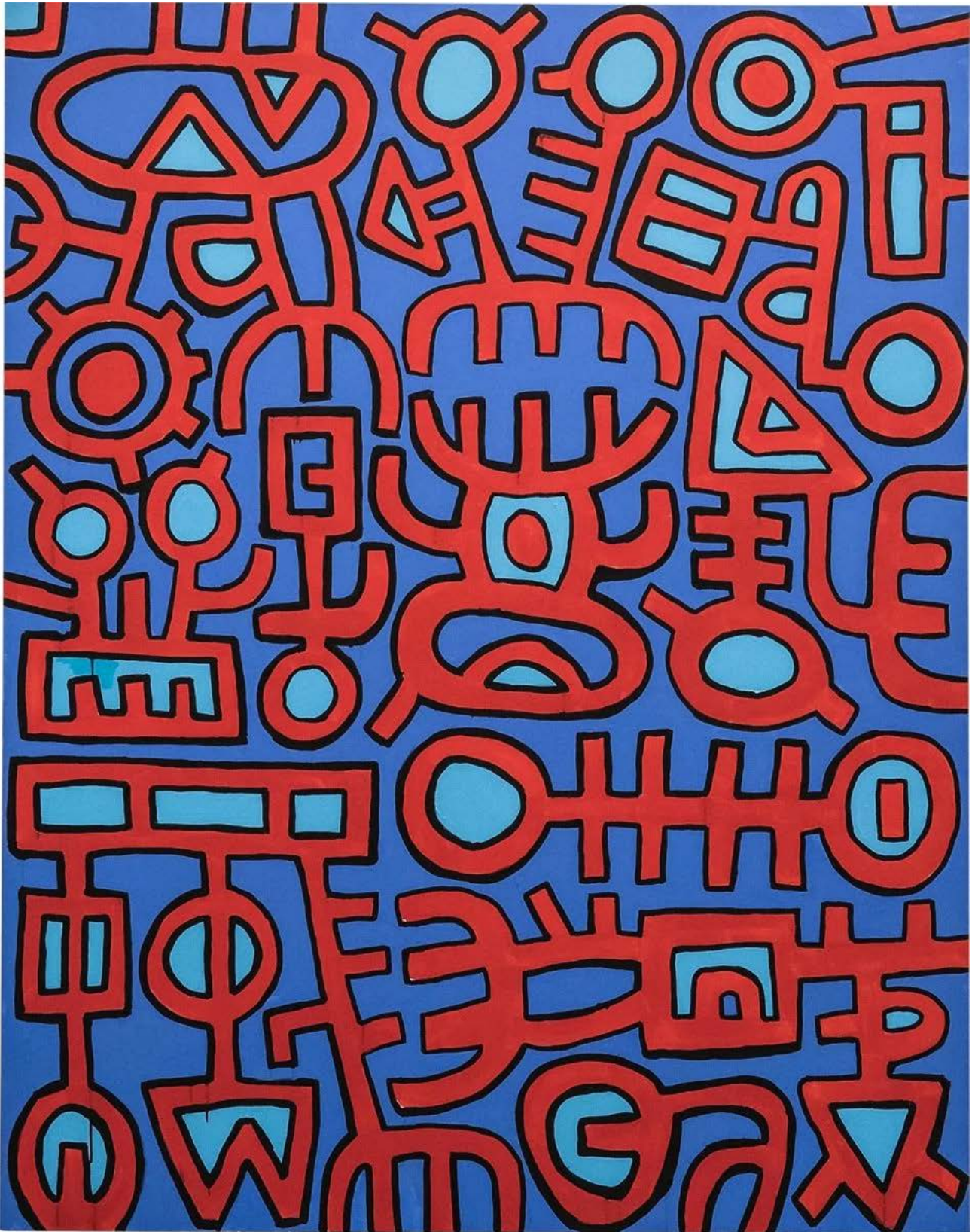
Mohamed Ahmed Ibrahim, "Untitled" (2019).