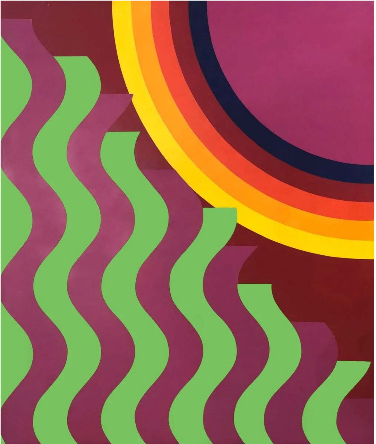
Mohamed Melehi, "Soleil Oblique" (1971).