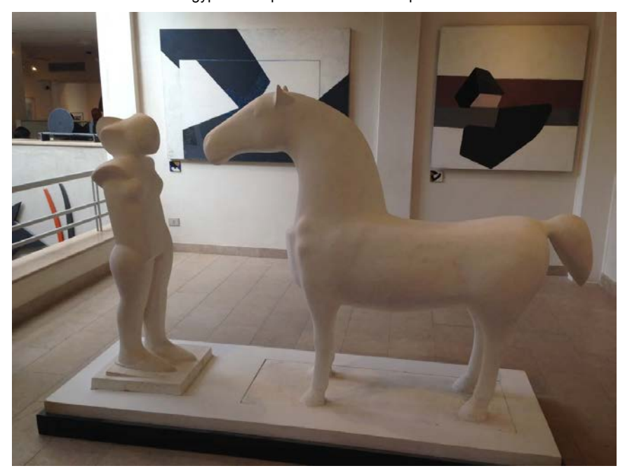
Henein's home in Giza has been a museum since 2014, showcasing his sculptures and paintings

A second work is Paysage Gris (Grey landscape) a papyrus work resembling stoneware or granite but made with pointilliste grains of colour. The Barjeel Art Foundation in the UAE and the Dalloul Art Foundation in Beirut also hold Henein's work.