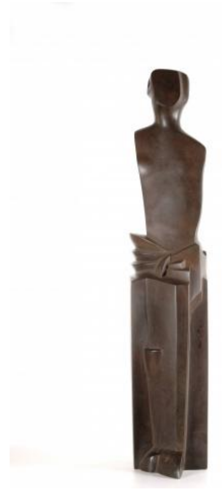
'Sitting Figure' by Adam Henein, 1991

The project included restoring not only the Sphinx's arm and chest area but also the entire base of the monument, replacing mismatched stone and cement deep inside.