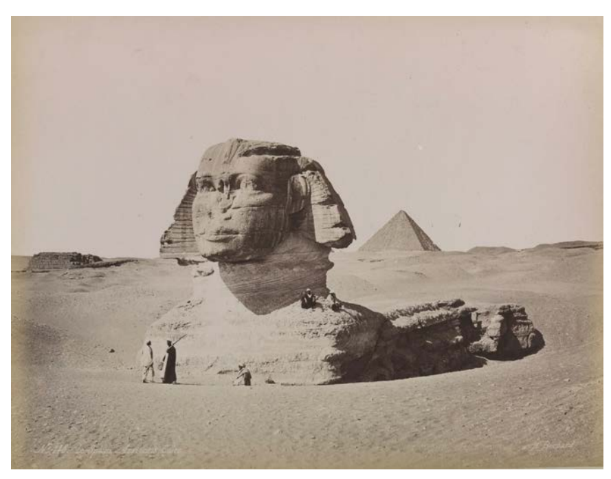
The Sphinx partially under the sand, circa 1870s

The limestone Great Sphinx is 66 feet high and 240 feet long, thought to have been carved under Pharaoh Khafre in about 2550 BC, or 4570 years ago. From early on the monument needed upkeep; erosion quickly took its toll, while more than once the Sphinx was dug out of drifting sand.