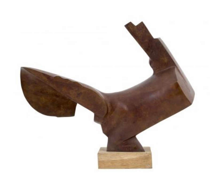
'The Rooster', 1979 bronze sculpture by Adam Henein, Egypt

On his death this May, aged 91, Henein was mourned as one of Egypt's most praised and popular artists, known for his paintings on papyrus, using natural pigments and Arabic gum, but above all for sculptures of bronze or granite. He represented the country in the Venice Biennale and exhibited at the Metropolitan Museum of Art in New York.