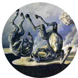
HORSE PAINTING Moosa Al Halyan