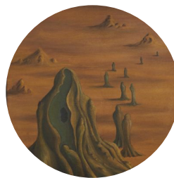
METAPHYSIC Salah Taher