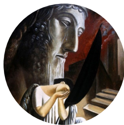
WAR PAINTING Afifa Alelby