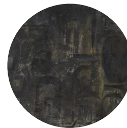
MINDSCAPE Maliheh Afnan