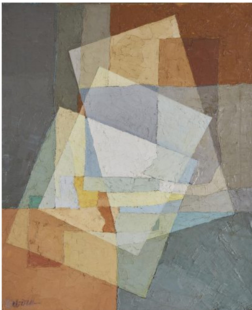
Oil on canvas, 65 x 45 cm