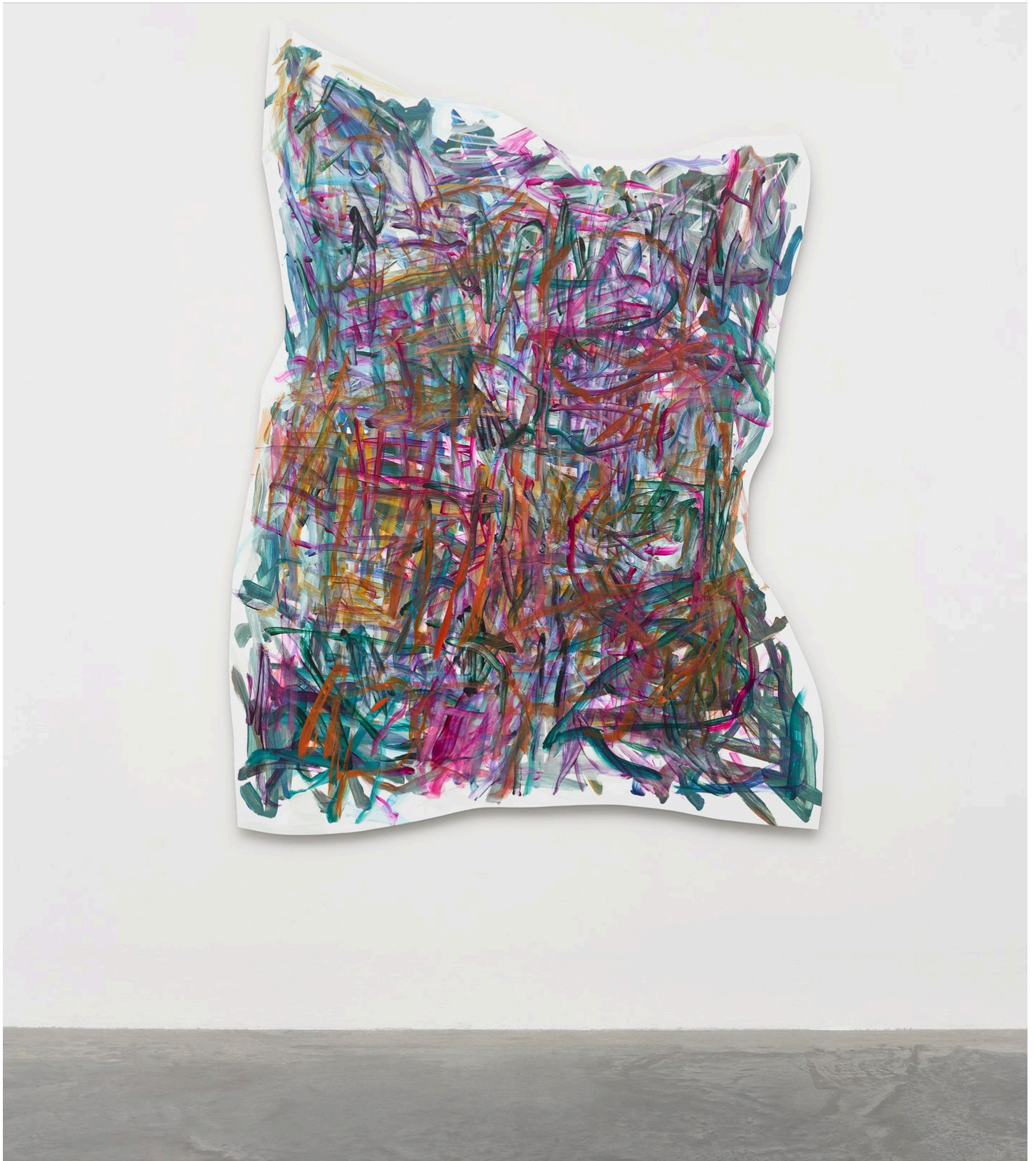
Imi Knoebel, Figura Psi (2019). Acrylic on aluminium. 239 x 173 x 4.4 cm. Copyright the artist.