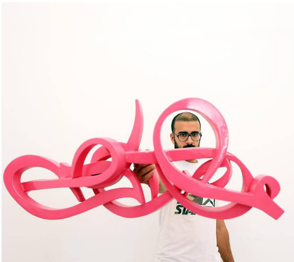
The Tunisian artist eL Seed says his latest exhibition is a statement of love for calligraphy, an ageing art that he says deserves to be honoured.

► eL Seed has spent the last year at Tashkeel studio hub in Dubai working on a new show of three dimensional letters.